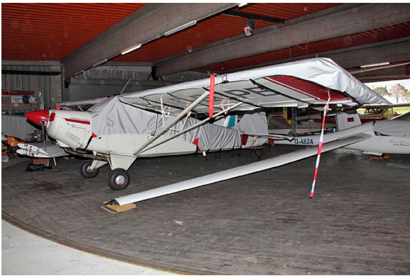
Aviat Husky Insulated Engine Cover, Canopy & Wing Covers Aviat Husky Engine Plugs, Canopy, Wing & Empennage Covers