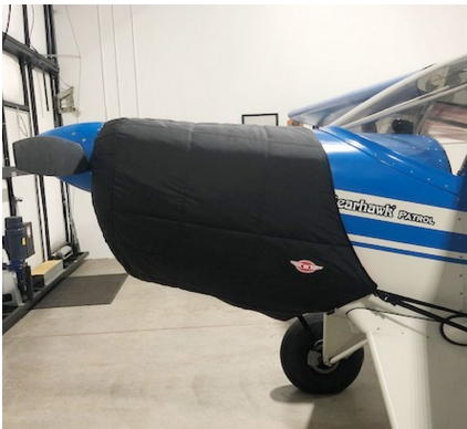
Bearhawk Patrol Insulated Engine Cover