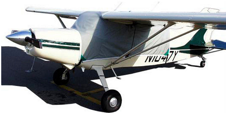
Maule M-7 Standard Canopy Cover