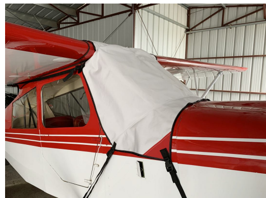
Bellanca Citabria Windshield/Skylight Cover