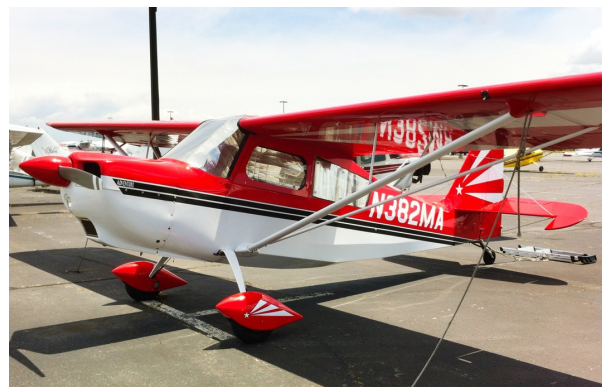
Bellanca Decathlon HeatShield Set