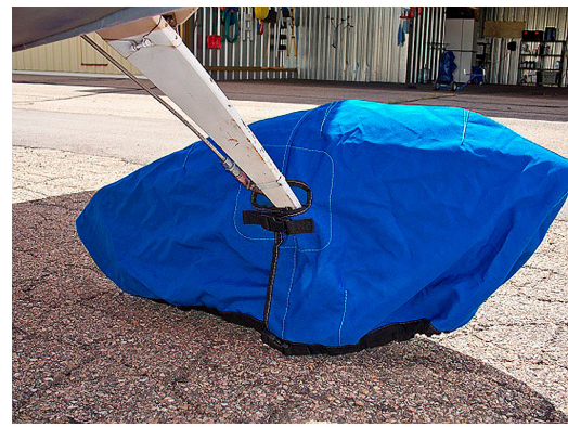
Bellanca Citabria Wheelpant Cover