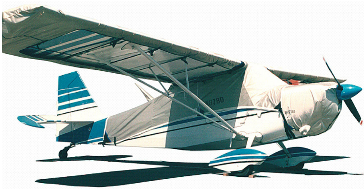
Bellanca Citabria Over-Top Canopy Cover, Extended to Tail, Engine & Wing Covers