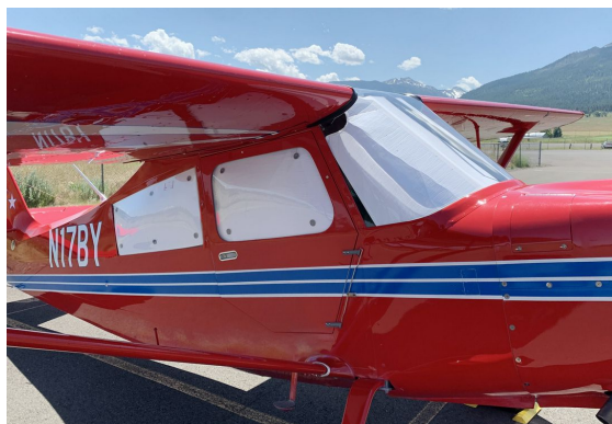
Bellanca Decathlon 8KCAB Heatshield Set with white side out

Windshield Heatshields are interior sunshades for an aircraft's front windshield. The product is a unique composite of closed-cell foam with a silver mylar finish. The semi-rigid design is stiff enough to stand along the inside of the windshield using sun visors or window framing. It folds up flat and easily stores in the included storage sleeve. Some designs may require velcro and suction cups or split right and left sides. A Heatshield is an excellent short-term remedy for cockpit overheating. An external fabric cover is far more effective and practical for long-term protection.