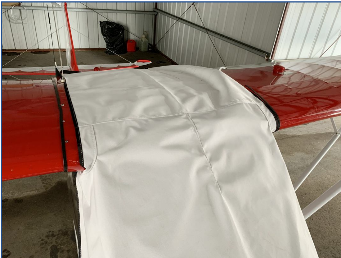
Bellanca Citabria Windshield/Skylight Cover