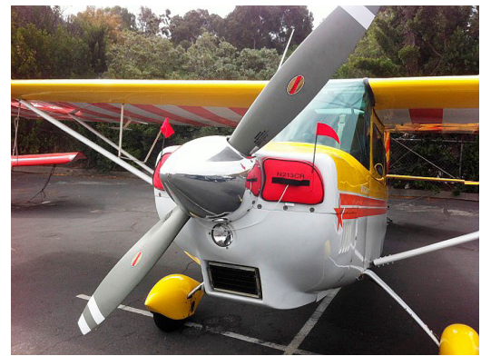
Bellanca Citabria Engine Plugs