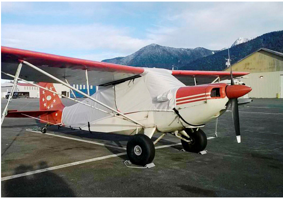
Bellanca Citabria Over-Top Canopy Cover, extended to tail