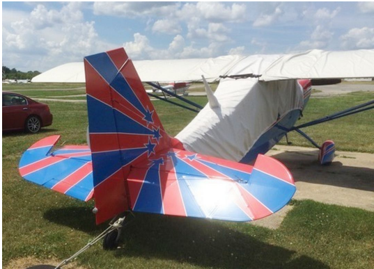
Bellanca Decathlon Canopy Cover (Over-Top, Extended to tail), Wing Covers.

WINTER USE MATERIAL - Made with Solution-Dyed Polyester fabric, this option is intended for seasonal use to aid in deicing, rain mitigation, or for occasional travel. The material is lighter and more compact, but more susceptible to UV damage and may have a shorter useful life if used continuously outside than the all-year use material.