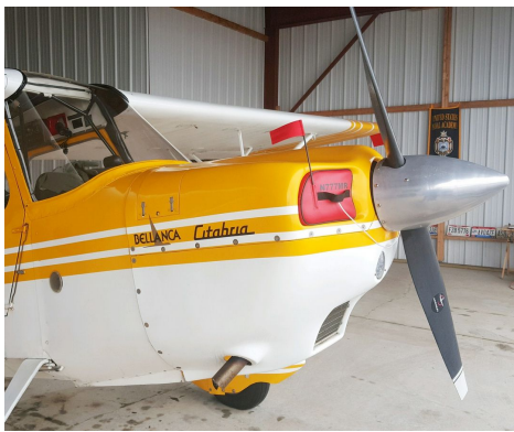
Bellanca Citabria, Scout, Explorer Engine Inlet Plugs