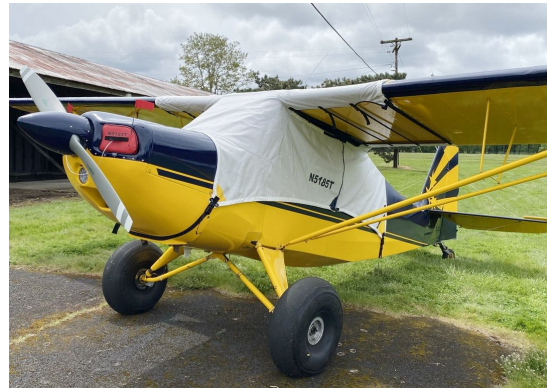
American Champion Citabria canopy cover over the top style, extends to cover gas caps, Engine Plugs