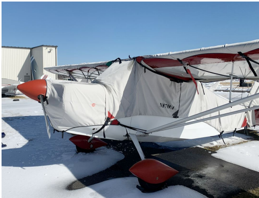
American Champion Decathlon Extended Canopy, Engine, Wing & Empennage Covers

This cover type is made from Silver Acrylic Sunbrella canvas and is 100% lined with a soft and smooth microfiber. Bruce's Custom Covers developed this material combination especially for aircraft protection. The outer material is medium weight and treated for water resistance, UV resistance and anti-static buildup. The inner lining is a very soft and smooth microfiber to prevent scratching. The material is very reflective, and tests show that the cabin interior temperature can be reduced to near-ambient temperature on the hottest of days. It is water, ice and snow repellent, yet breathable to allow moisture to escape from between the cover and the aircraft surface.