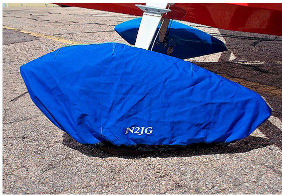
Bellanca Citabria Wheelpant Cover