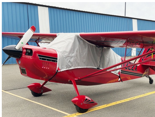
Bellanca Decathlon Travel Canopy Cover

This cover type is made from Silver Acrylic Sunbrella canvas and is 100% lined with a soft and smooth microfiber. Bruce's Custom Covers developed this material combination especially for aircraft protection. The outer material is medium weight and treated for water resistance, UV resistance and anti-static buildup. The inner lining is a very soft and smooth microfiber to prevent scratching. The material is very reflective, and tests show that the cabin interior temperature can be reduced to near-ambient temperature on the hottest of days. It is water, ice and snow repellent, yet breathable to allow moisture to escape from between the cover and the aircraft surface.