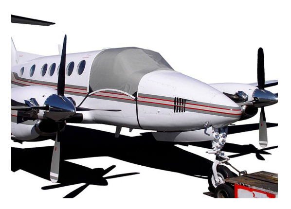
King Air 200/300 Snap-On Windshield Cover