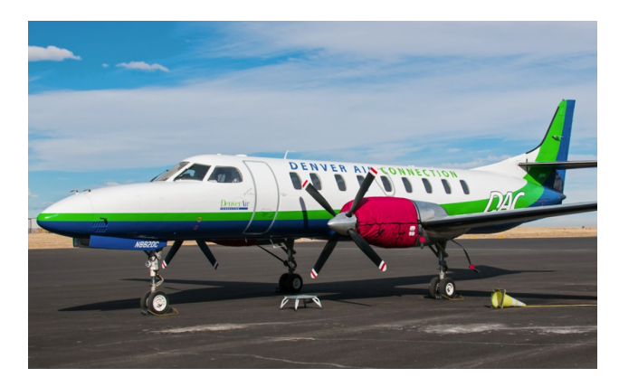
Merlin Insulated Engine Covers

Socata TBM Insulated 5-Blade Prop/Spinner Cover