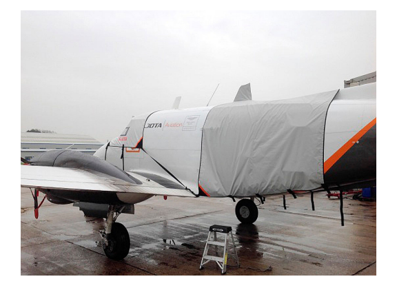
King Air Cargo/Jump Door Rain Cover

This cover type is made from Silver Acrylic Sunbrella canvas and is 100% lined with a soft and smooth microfiber. Bruce's Custom Covers developed this material combination especially for aircraft protection. The outer material is medium weight and treated for water resistance, UV resistance and anti-static buildup. The inner lining is a very soft and smooth microfiber to prevent scratching. The material is very reflective, and tests show that the cabin interior temperature can be reduced to near-ambient temperature on the hottest of days. It is water, ice and snow repellent, yet breathable to allow moisture to escape from between the cover and the aircraft surface.