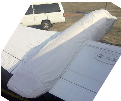
King Air 350 Engine Cover

This cover type is made from Silver Acrylic Sunbrella canvas and is 100% lined with a soft and smooth microfiber. Bruce's Custom Covers developed this material combination especially for aircraft protection. The outer material is medium weight and treated for water resistance, UV resistance and anti-static buildup. The inner lining is a very soft and smooth microfiber to prevent scratching. The material is very reflective, and tests show that the cabin interior temperature can be reduced to near-ambient temperature on the hottest of days. It is water, ice and snow repellent, yet breathable to allow moisture to escape from between the cover and the aircraft surface.