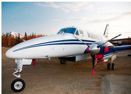
Beech 99 Engine Plugs & Prop Ties

Engine Inlet Plugs are custom fit for your Beech 99 Airliner intakes, made with heavy-duty vinyl material, and stuffed with a single block of sculpted urethane foam. Each plug has a zipper that allows the foam to be removed and dried if necessary. Engine plugs have warning flags that are visible from the cockpit or 'remove before flight' streamers sewn onto the face of the plugs. Most plugs are imprinted with the aircraft registration number in black for an extra charge. Storage bag NOT included. Engine plugs may be inserted after flight when the engine is still warm. Engine Inlet Plugs are commonly referred to as Cowl Plugs, Intake Plugs, Cowl Blocks, Engine Blocks, and Engine Bungs.