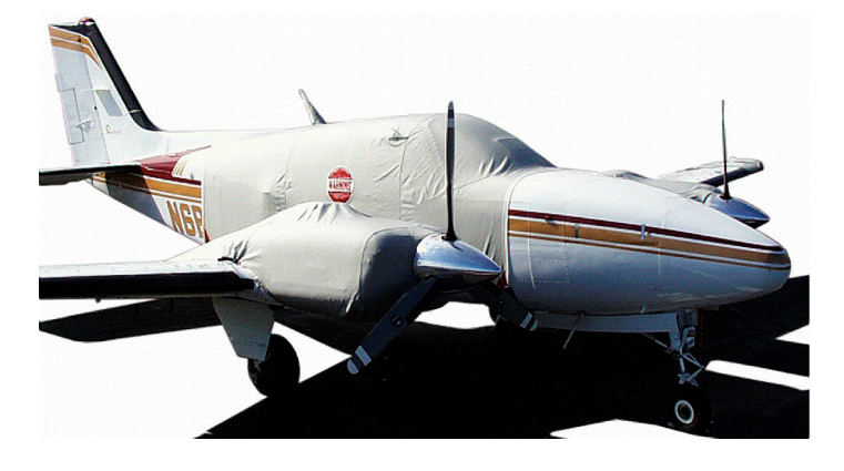
Standard Canopy Cover & Engine Plugs. Extended Canopy Cover & Engine Cover

This cover type is made from Silver Acrylic Sunbrella canvas and is 100% lined with a soft and smooth microfiber. Bruce's Custom Covers developed this material combination especially for aircraft protection. The outer material is medium weight and treated for water resistance, UV resistance and anti-static buildup. The inner lining is a very soft and smooth microfiber to prevent scratching. The material is very reflective, and tests show that the cabin interior temperature can be reduced to near-ambient temperature on the hottest of days. It is water, ice and snow repellent, yet breathable to allow moisture to escape from between the cover and the aircraft surface.