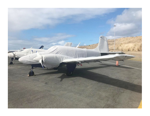
Beech Travel Air Full Cover Set