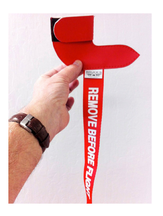
Standard Pitot Cover