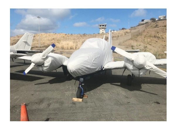
Beech Travel Air Full Cover Set