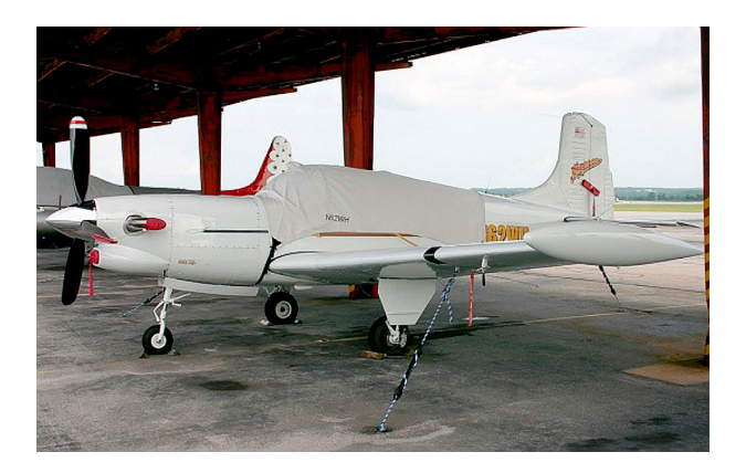
Beech B95 Travel Air Canopy Cover (Turbine Model)