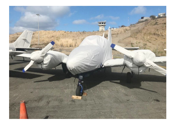
Beech Travel Air Full Cover Set