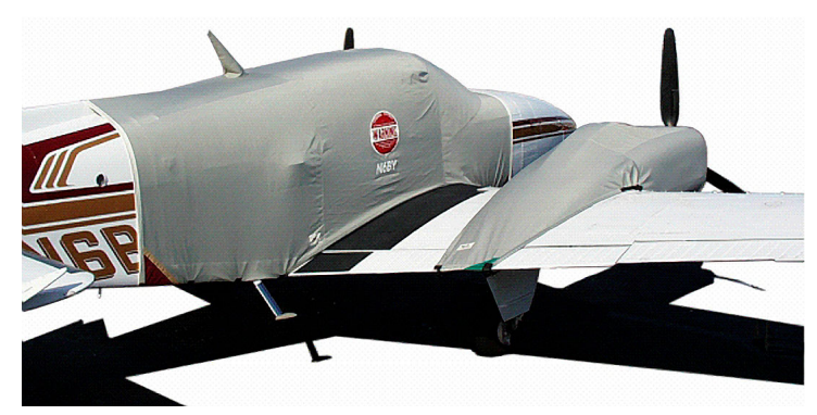
Baron Extended Canopy Cover & Engine Covers