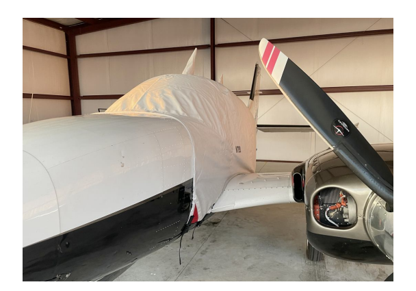
Beech Baron 58TC Extended Canopy Cover

This cover type is made from Silver Acrylic Sunbrella canvas and is 100% lined with a soft and smooth microfiber. Bruce's Custom Covers developed this material combination especially for aircraft protection. The outer material is medium weight and treated for water resistance, UV resistance and anti-static buildup. The inner lining is a very soft and smooth microfiber to prevent scratching. The material is very reflective, and tests show that the cabin interior temperature can be reduced to near-ambient temperature on the hottest of days. It is water, ice and snow repellent, yet breathable to allow moisture to escape from between the cover and the aircraft surface.