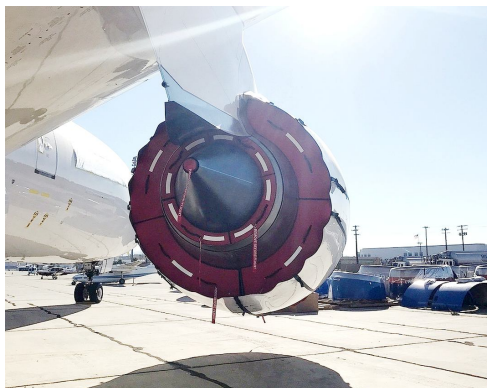
Boeing 787 Dreamliner Bypass Vent, Turbine Exhaust, & Exhaust Nozzle Plugs, Genx Engines