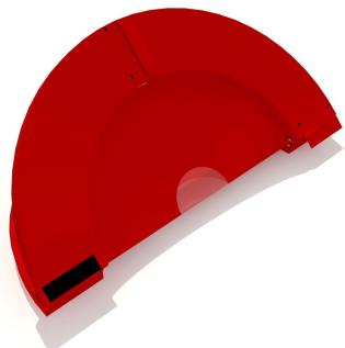
Airbus A330 Intake Plug, framed bi-fold type

The Engine Exhaust Plugs are custom fit for your Boeing 787 Dreamliner exhaust openings, made with heavy-duty vinyl material, and stuffed with a single block of sculpted urethane foam. Each plug has a zipper that allows the foam to be removed and dried if necessary. Exhaust plugs have 'remove before flight' streamers sewn onto the face of the plugs. Most plugs are imprinted with the aircraft registration number in black for an extra charge. Exhaust plugs may be inserted soon after flight when the engine is still warm. Engine Inlet Plugs are commonly referred to as Cowl Plugs, Intake Plugs, Cowl Blocks, Engine Blocks, and Engine Bungs.