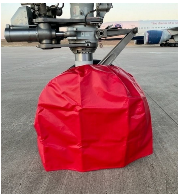
Boeing 777 Nose Gear Tire Covers

ALL-YEAR USE MATERIAL - Made with Silver Acrylic Sunbrella canvas, the all-year use material is the best option for sun protection and cover longevity. This heavier more durable material is intended for all weather conditions, such as rain and snow or lots of sun.