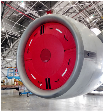
Boeing 777 Intake Plugs, Folding Type