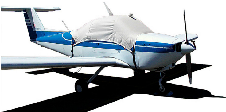
Canopy Cover for Beech Skipper