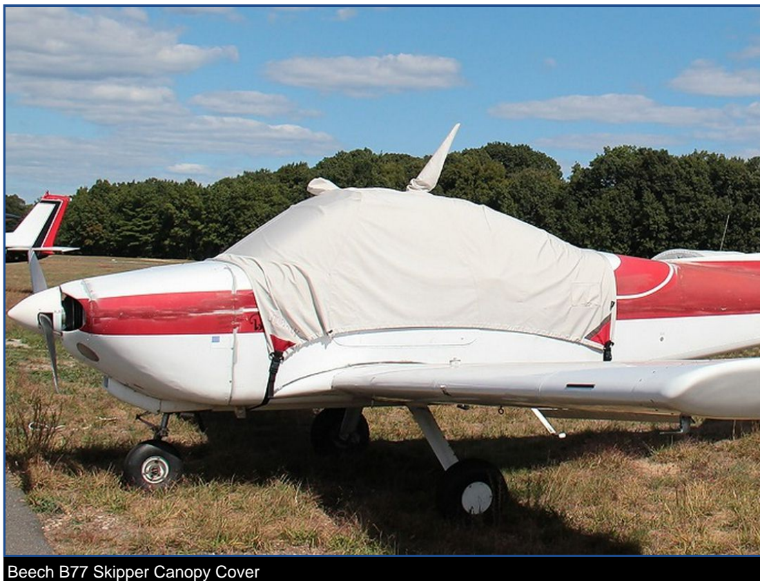
Beech B77 Skipper Canopy Cover