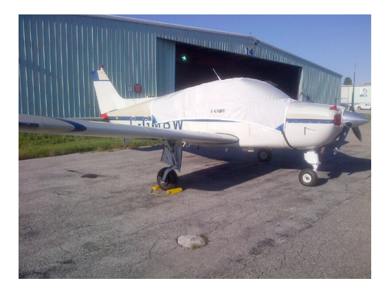
Beech Sierra Canopy Cover, Engine Plugs, Tailcone Cover

plugs are imprinted with the aircraft registration number in black for an extra charge. Storage bag NOT included. Engine plugs may be inserted after flight when the engine is still warm. Engine Inlet Plugs are commonly referred to as Cowl Plugs, Intake Plugs, Cowl Blocks, Engine Blocks, and Engine Bungs.