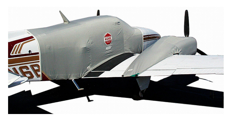
Baron Extended Canopy Cover & Engine Covers

Beech Sierra Canopy Cover, Engine Plugs, Tailcone Cover