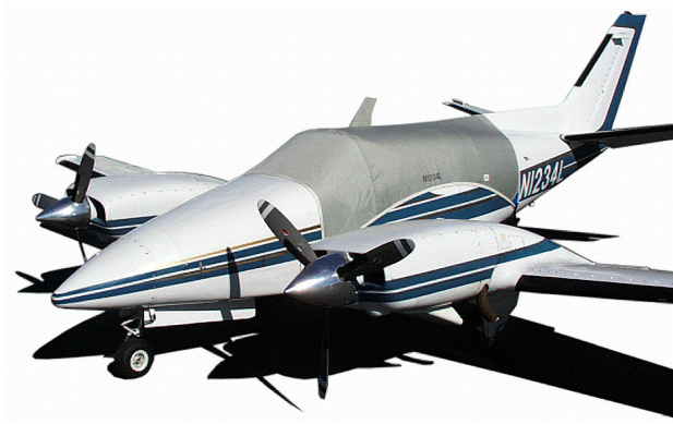
Beech Duke Standard Canopy Cover