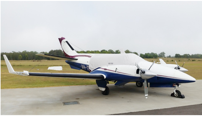
Beech Duke Canopy Cover