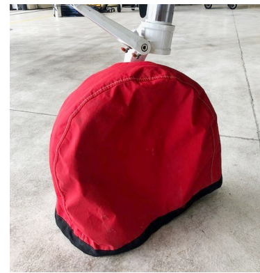
Beech King Air 300 Tire Covers (nose gear)