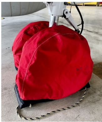
Beech King Air 300 Tire Covers (main gear)