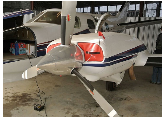
Beech Duke Engine Inlet Plugs