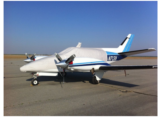
Beech B60 Duke Canopy/Nose Cover