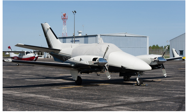
Beech Duke Canopy Cover