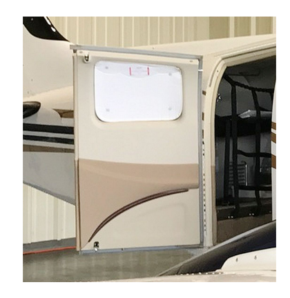
Beech Bonanza Heatshield Set