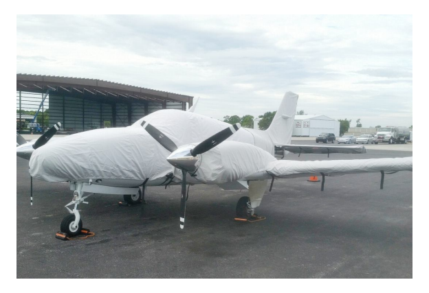
Full Cover Set (58P-020, 58P-225, 58P-405)

WINTER USE MATERIAL - Made with Solution-Dyed Polyester fabric, this option is intended for seasonal use to aid in deicing, rain mitigation, or for occasional travel. The material is lighter and more compact, but more susceptible to UV damage and may have a shorter useful life if used continuously outside than the all-year use material.