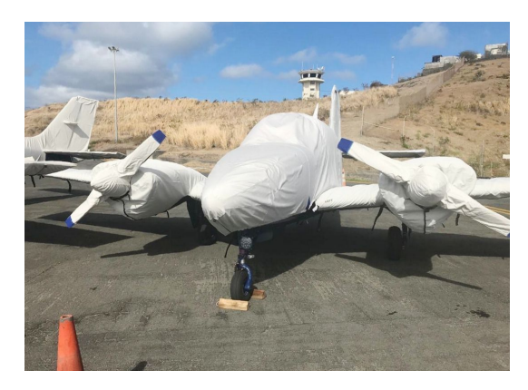
Beech Travel Air Full Cover Set