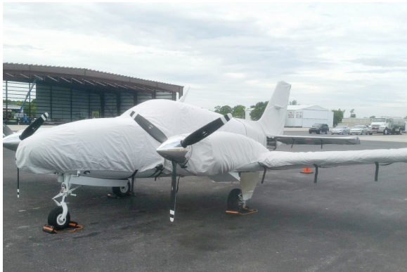
Full Cover Set (58P-020, 58P-225, 58P-405)

WINTER USE MATERIAL - Made with Solution-Dyed Polyester fabric, this option is intended for seasonal use to aid in deicing, rain mitigation, or for occasional travel. The material is lighter and more compact, but more susceptible to UV damage and may have a shorter useful life if used continuously outside than the all-year use material.