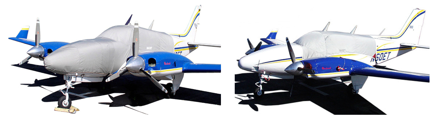
Baron Canopy/Nose Cover

Travel Covers are made with Silver Solution-Dyed Polyester fabric and only lined over the windshield to save weight. The material is lightweight and more compact for easy stowage in the aircraft. The polyester material is water resistant, but only intended for occasional use outside. We also have an ultra lightweight material available for fitted hangar dust covers. For daily outdoor use, the non-travel Sunbrella Cover is the best choice.