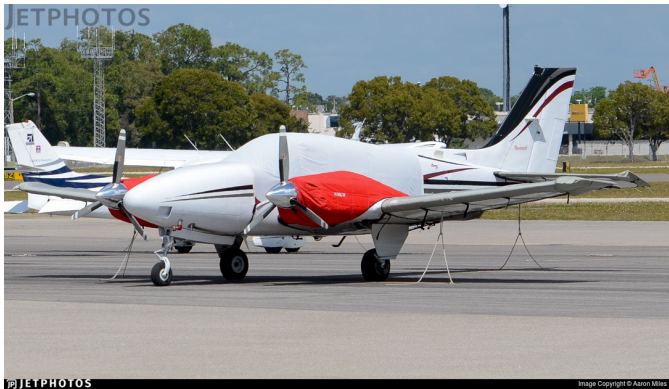
Beech Baron 58, G58 Canopy Cover, Insulated Engine Covers

water resistance, UV resistance and anti-static buildup. The inner lining is a very soft and smooth microfiber to prevent scratching. The material is very reflective, and tests show that the cabin interior temperature can be reduced to near-ambient temperature on the hottest of days. It is water, ice and snow repellent, yet breathable to allow moisture to escape from between the cover and the aircraft surface.