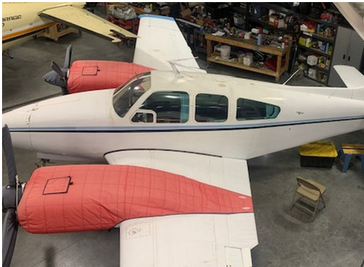
Beech Baron B55 Insulated Engine Covers