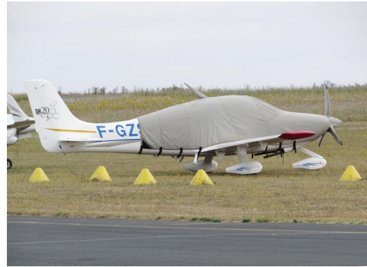
Cirrus SR-22 Extended Canopy/Engine Cover, Prop Cover, Wingtip Pads