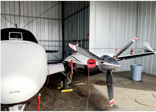
Baron 58 Engine Plugs