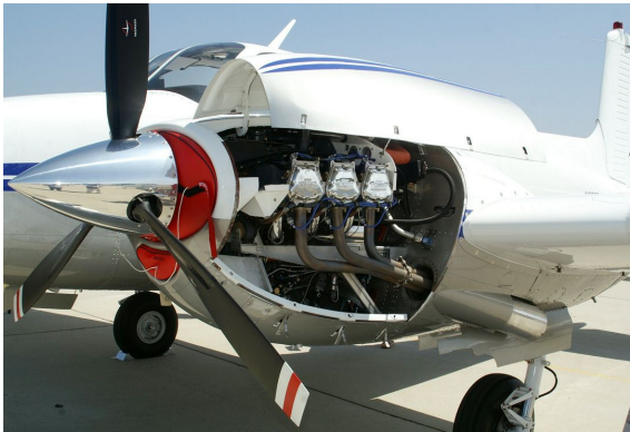
Twin Bonanza Engine Inlet Plugs