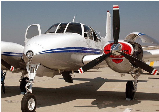
Beech Twin Bonanza Engine Inlet Plugs