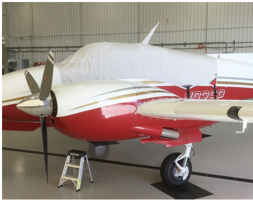
Beech Twin Bonanza D50A Canopy Cover

This cover type is made from Silver Acrylic Sunbrella canvas and is 100% lined with a soft and smooth microfiber. Bruce's Custom Covers developed this material combination especially for aircraft protection. The outer material is medium weight and treated for water resistance, UV resistance and anti-static buildup. The inner lining is a very soft and smooth microfiber to prevent scratching. The material is very reflective, and tests show that the cabin interior temperature can be reduced to near-ambient temperature on the hottest of days. It is water, ice and snow repellent, yet breathable to allow moisture to escape from between the cover and the aircraft surface.