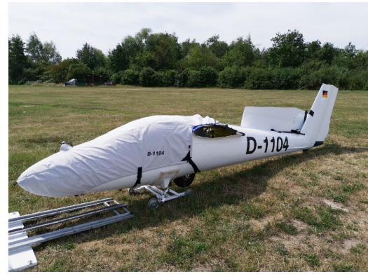
Pilatus B-4 Canopy/Nose Cover