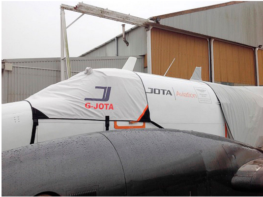
King Air Windshield/Cockpit Cover

The material is very reflective, and tests show that the cabin interior temperature can be reduced to near-ambient temperature on the hottest of days. It is water, ice and snow repellent, yet breathable to allow moisture to escape from between the cover and the aircraft surface.