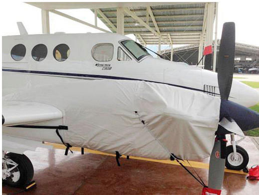
King Air C90 Engine Cover

This cover type is made from Silver Acrylic Sunbrella canvas and is 100% lined with a soft and smooth microfiber. Bruce's Custom Covers developed this material combination especially for aircraft protection. The outer material is medium weight and treated for water resistance, UV resistance and anti-static buildup. The inner lining is a very soft and smooth microfiber to prevent scratching. The material is very reflective, and tests show that the cabin interior temperature can be reduced to near-ambient temperature on the hottest of days. It is water, ice and snow repellent, yet breathable to allow moisture to escape from between the cover and the aircraft surface.