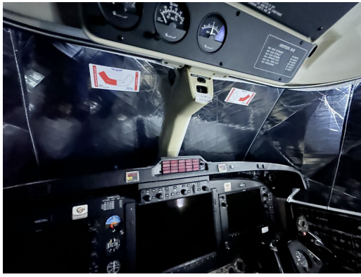
Beechcraft B200 Cockpit Heatshields