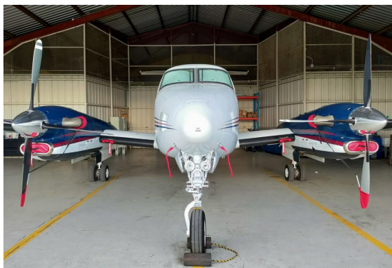
Beech King Air Prop Tie-Downs/Exhaust Covers

Engine Inlet Plugs are custom fit for your Beech King Air 350 & 360 intakes, made with heavy-duty vinyl material, and stuffed with a single block of sculpted urethane foam. Each plug has a zipper that allows the foam to be removed and dried if necessary. Engine plugs have warning flags that are visible from the cockpit or 'remove before flight' streamers sewn onto the face of the plugs. Most plugs are imprinted with the aircraft registration number in black for an extra charge. Storage bag NOT included. Engine plugs may be inserted after flight when the engine is still warm. Engine Inlet Plugs are commonly referred to as Cowl Plugs, Intake Plugs, Cowl Blocks, Engine Blocks, and Engine Bungs. Prop Tie-Down/Exhaust Covers are made of heavy duty red vinyl material. Thick nylon webbing runs from the exhaust covers to the prop boot. This webbing is adjustable with plastic buckles, and is held tight with a steel spring where it attaches to the prop boot.