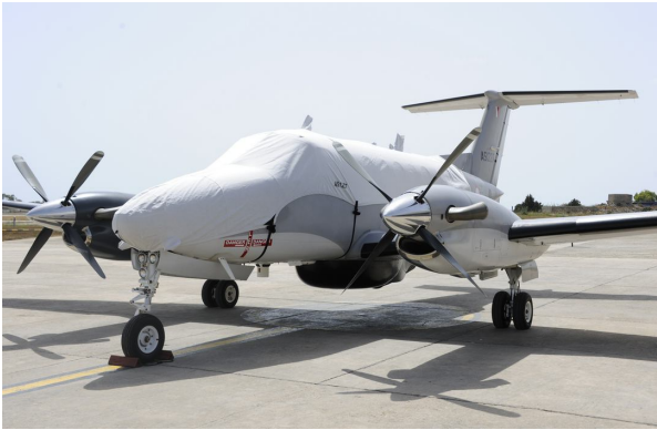
King Air 200 Canopy/Nose Cover