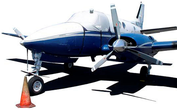
King Air Cockpit Cover, belly-strap type