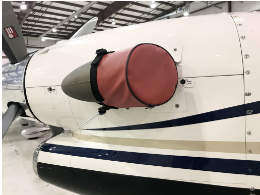
Beech King Air 350 Exhaust Covers