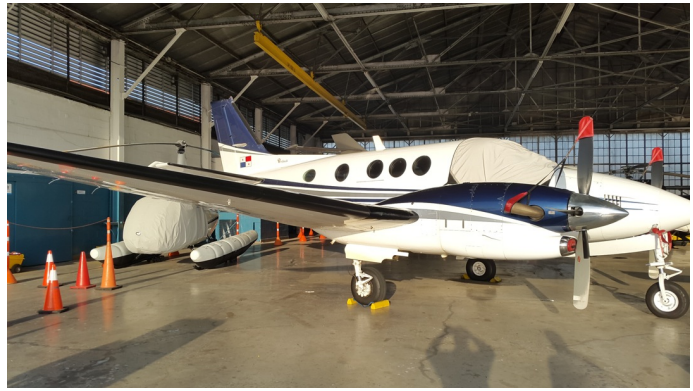
Raytheon Beech King Air Cockpit Cover, Prop Tie/Exhaust Covers, Inlet Plugs