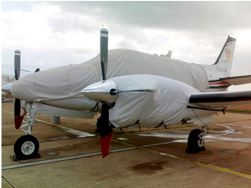
King Air C90 Canopy/Nose Cover, Engine Covers

water resistance, UV resistance and anti-static buildup. The inner lining is a very soft and smooth microfiber to prevent scratching. The material is very reflective, and tests show that the cabin interior temperature can be reduced to near-ambient temperature on the hottest of days. It is water, ice and snow repellent, yet breathable to allow moisture to escape from between the cover and the aircraft surface.