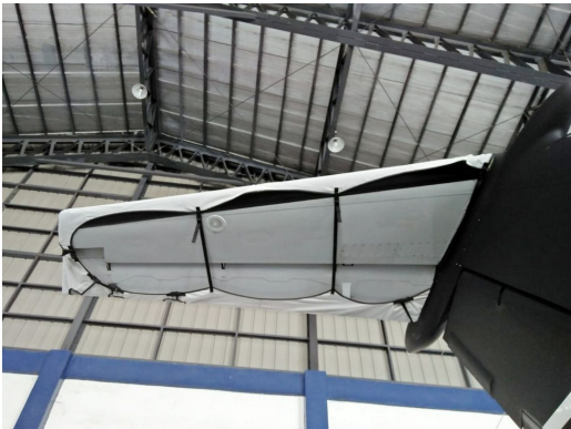
Beech King Air B350 Horizontal Stabilizer Covers

WINTER USE MATERIAL - Made with Solution-Dyed Polyester fabric, this option is intended for seasonal use to aid in deicing, rain mitigation, or for occasional travel. The material is lighter and more compact, but more susceptible to UV damage and may have a shorter useful life if used continuously outside than the all-year use material.