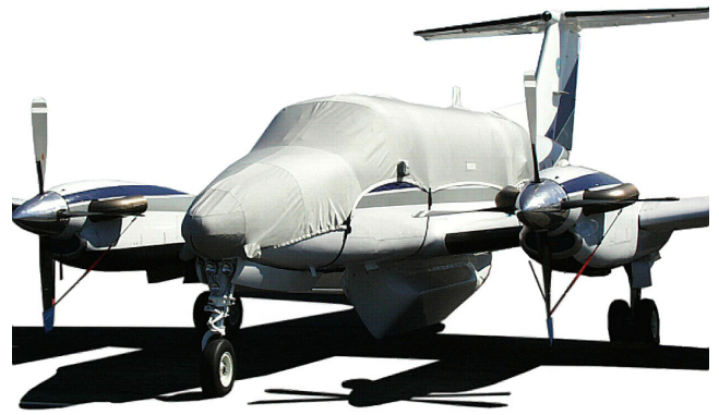
King Air Canopy/Nose Cover