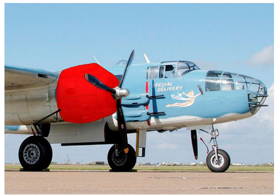
B25 Engine Cover, Illustration