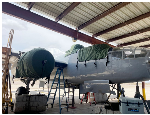
Mitchell B25 Cockpit, Turret & Engine Covers