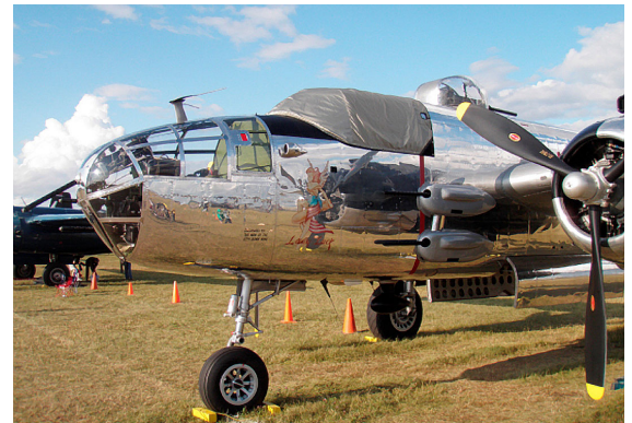
Mitchell B25 Cockpit Cover (Snap-On Type)