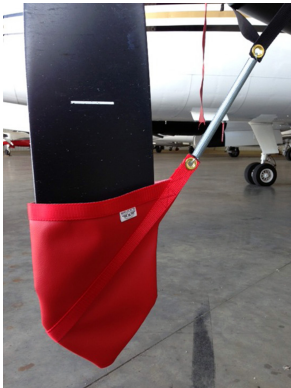
King Air Prop Tie

This cover type is made from Silver Acrylic Sunbrella canvas and is 100% lined with a soft and smooth microfiber. Bruce's Custom Covers developed this material combination especially for aircraft protection. The outer material is medium weight and treated for water resistance, UV resistance and anti-static buildup. The inner lining is a very soft and smooth microfiber to prevent scratching. The material is very reflective, and tests show that the cabin interior temperature can be reduced to near-ambient temperature on the hottest of days. It is water, ice and snow repellent, yet breathable to allow moisture to escape from between the cover and the aircraft surface.