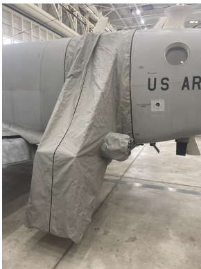
King Air Airstair Coor Cover