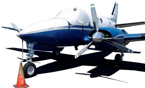
King Air Cockpit Cover, belly-strap type