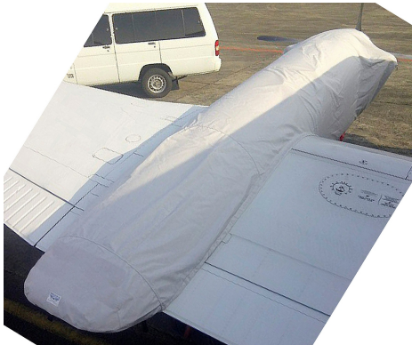
King Air 350 Engine Cover