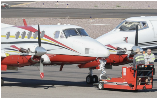
Inlet Plugs and Prop-Tie/Exhaust Covers

Engine Inlet Plugs are custom fit for your Beech King Air 200, 250, 260 (C-12, RC-12, UC-12) intakes, made with heavy-duty vinyl material, and stuffed with a single block of sculpted urethane foam. Each plug has a zipper that allows the foam to be removed and dried if necessary. Engine plugs have warning flags that are visible from the cockpit or 'remove before flight' streamers sewn onto the face of the plugs. Most plugs are imprinted with the aircraft registration number in black for an extra charge. Storage bag NOT included. Engine plugs may be inserted after flight when the engine is still warm. Engine Inlet Plugs are commonly referred to as Cowl Plugs, Intake Plugs, Cowl Blocks, Engine Blocks, and Engine Bung.