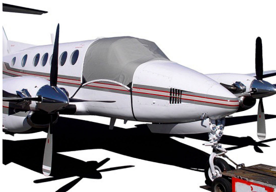
King Air 200/300 Snap-On Windshield Cover

Travel Covers are made with Silver Solution-Dyed Polyester fabric and only lined over the windshield to save weight. The material is lightweight and more compact for easy stowage in the aircraft. The polyester material is water resistant, but only intended for occasional use outside. We also have an ultra lightweight material available for fitted hangar dust covers. For daily outdoor use, the non-travel Sunbrella Cover is the best choice.