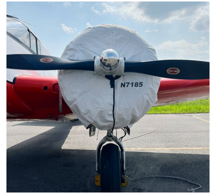
Beech 18 Engine Covers, non-insulated