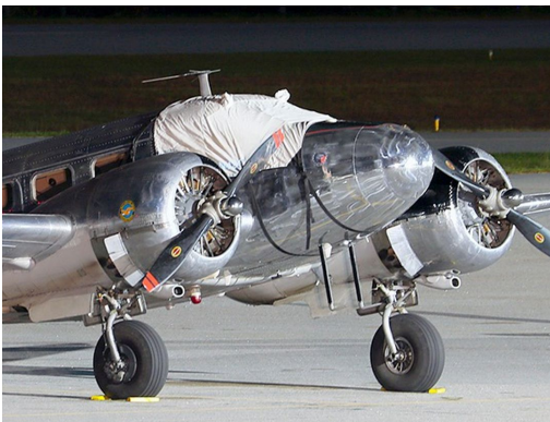
Beech D18S Cockpit Cover

This cover type is made from Silver Acrylic Sunbrella canvas and is 100% lined with a soft and smooth microfiber. Bruce's Custom Covers developed this material combination especially for aircraft protection. The outer material is medium weight and treated for water resistance, UV resistance and anti-static buildup. The inner lining is a very soft and smooth microfiber to prevent scratching. The material is very reflective, and tests show that the cabin interior temperature can be reduced to near-ambient temperature on the hottest of days. It is water, ice and snow repellent, yet breathable to allow moisture to escape from between the cover and the aircraft surface.