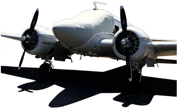
Beech 18 Cockpit/Nose Cover

Travel Covers are made with Silver Solution-Dyed Polyester fabric and only lined over the windshield to save weight. The material is lightweight and more compact for easy stowage in the aircraft. The polyester material is water resistant, but only intended for occasional use outside. We also have an ultra lightweight material available for fitted hangar dust covers. For daily outdoor use, the non-travel Sunbrella Cover is the best choice.