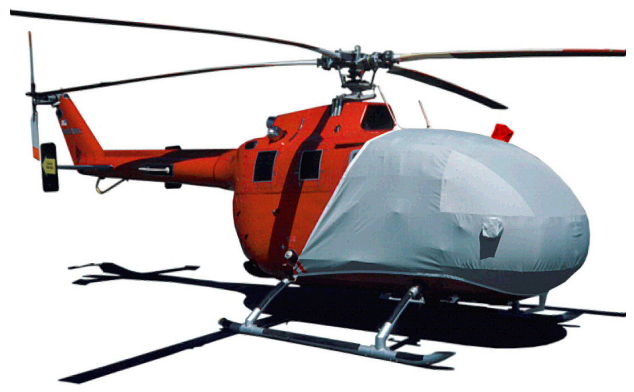
MBB BO-105 Bubble Cover