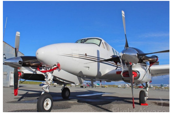
King Air C90A Engine Plugs and Pitot Covers