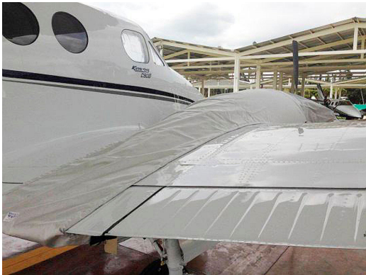
King Air C90 Engine Cover