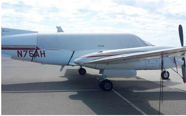
King Air 350 Canopy Cover