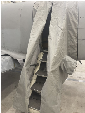
King Air Airstair Door Cover