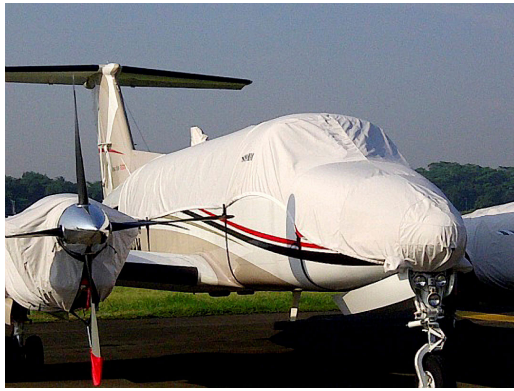
King Air 350 Canopy/Nose Cover, Engine Covers