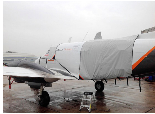
King Air Cargo/Jump Door Rain Cover