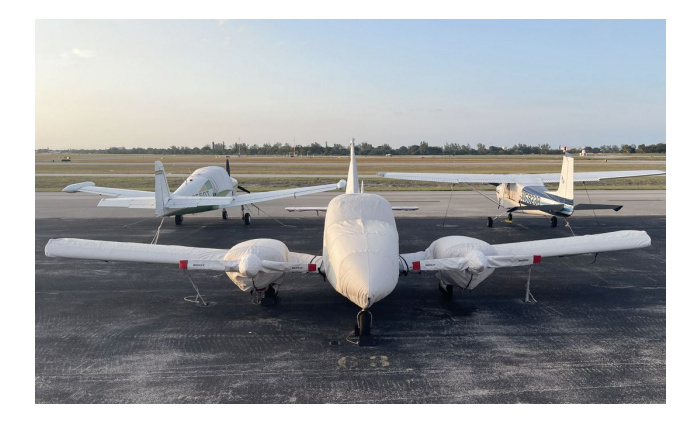
Piper Aztec Complete Cover Set