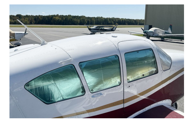
Piper Aztec HeatShields

Windshield Heatshields are interior sunshades for an aircraft's front windshield. The product is a unique composite of closed-cell foam with a silver mylar finish. The semi-rigid design is stiff enough to stand along the inside of the windshield using sun visors or window framing. It folds up flat and easily stores in the included storage sleeve. Some designs may require velcro and suction cups or split right and left sides. A Heatshield is an excellent short-term remedy for cockpit overheating. An external fabric cover is far more effective and practical for long-term protection.