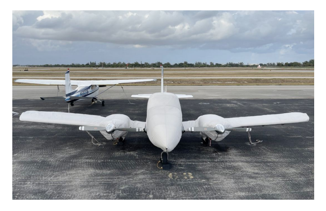
Piper Aztec Extended Canopy/Nose & Wing/Engine Covers

WINTER USE MATERIAL - Made with Solution-Dyed Polyester fabric, this option is intended for seasonal use to aid in deicing, rain mitigation, or for occasional travel. The material is lighter and more compact, but more susceptible to UV damage and may have a shorter useful life if used continuously outside than the all-year use material.