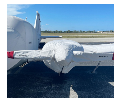
Piper Aztec Complete Cover Set