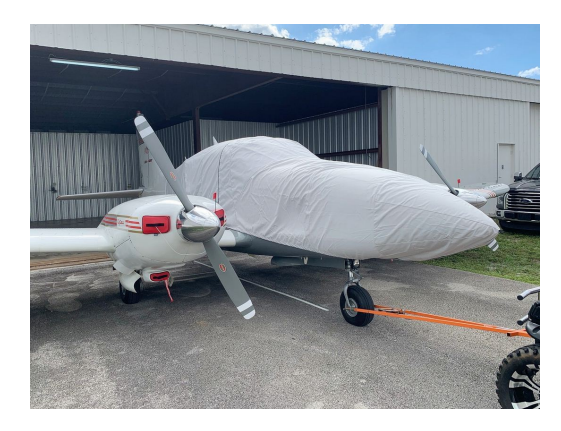
Piper Aztec Extended Canopy/Nose Cover, Engine Plugs

are imprinted with the aircraft registration number in black for an extra charge. Storage bag NOT included. Engine plugs may be inserted after flight when the engine is still warm. Engine Inlet Plugs are commonly referred to as Cowl Plugs, Intake Plugs, Cowl Blocks, Engine Blocks, and Engine Bungs.