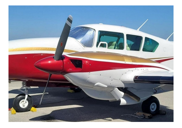
Piper Aztec Windshield HeatShield