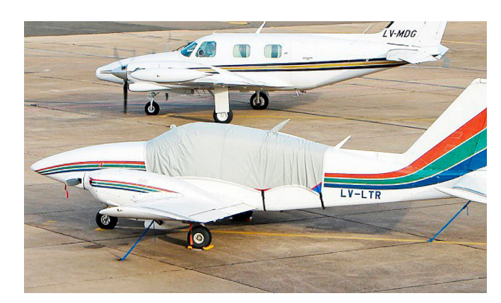
Aztec Canopy Cover

Travel Covers are made with Silver Solution-Dyed Polyester fabric and only lined over the windshield to save weight. The material is lightweight and more compact for easy stowage in the aircraft. The polyester material is water resistant, but only intended for occasional use outside. We also have an ultra lightweight material available for fitted hangar dust covers. For daily outdoor use, the non-travel Sunbrella Cover is the best choice.