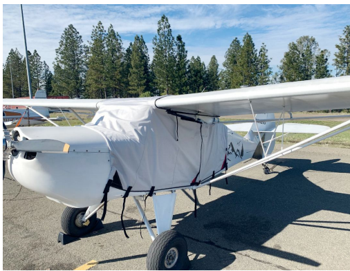
Avid Heavy Hauler MK 4 Over The Top Style Canopy Cover