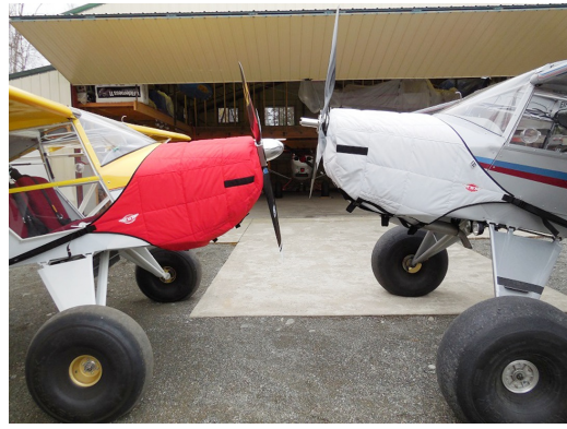
Avid Insulated Engine Covers