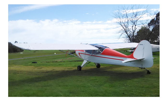
Auster J5 Autocar Wing Covers