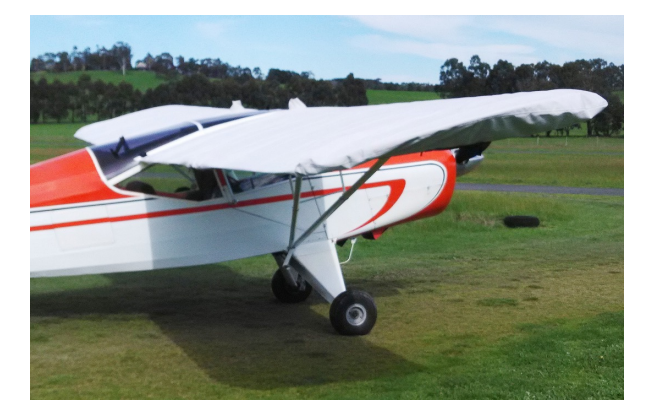
Auster J5 Autocar Wing Covers

WINTER USE MATERIAL - Made with Solution-Dyed Polyester fabric, this option is intended for seasonal use to aid in deicing, rain mitigation, or for occasional travel. The material is lighter and more compact, but more susceptible to UV damage and may have a shorter useful life if used continuously outside than the all-year use material.