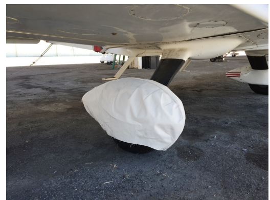
Grumman AA5 Main Wheelpant Cover, test fit