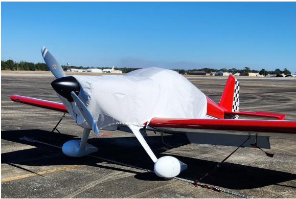
Van's RV-6 Extended Canopy/Engine Cover

This cover type is made from Silver Acrylic Sunbrella canvas and is 100% lined with a soft and smooth microfiber. Bruce's Custom Covers developed this material combination especially for aircraft protection. The outer material is medium weight and treated for water resistance, UV resistance and anti-static buildup. The inner lining is a very soft and smooth microfiber to prevent scratching. The material is very reflective, and tests show that the cabin interior temperature can be reduced to near-ambient temperature on the hottest of days. It is water, ice and snow repellent, yet breathable to allow moisture to escape from between the cover and the aircraft surface.