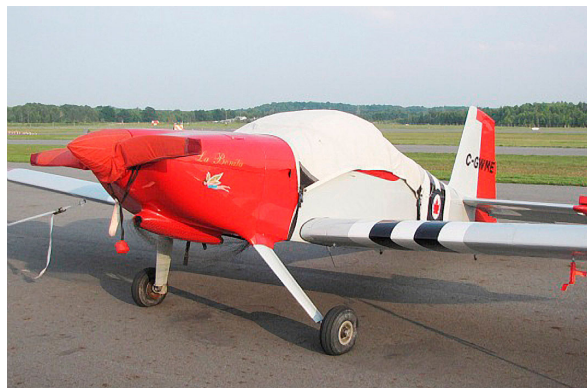
Van's RV-6 2-Blade Prop Cover