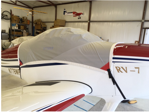
Van's RV-7 Travel Canopy Cover

Travel Covers are made with Silver Solution-Dyed Polyester fabric and only lined over the windshield to save weight. The material is lightweight and more compact for easy stowage in the aircraft. The polyester material is water resistant, but only intended for occasional use outside. We also have an ultra lightweight material available for fitted hangar dust covers. For daily outdoor use, the non-travel Sunbrella Cover is the best choice.