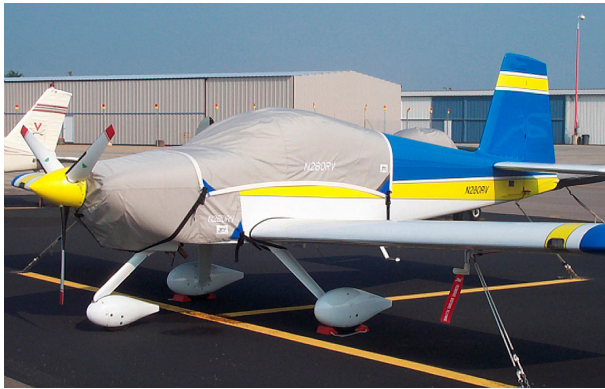
Van's RV-9 Canopy & Engine Covers