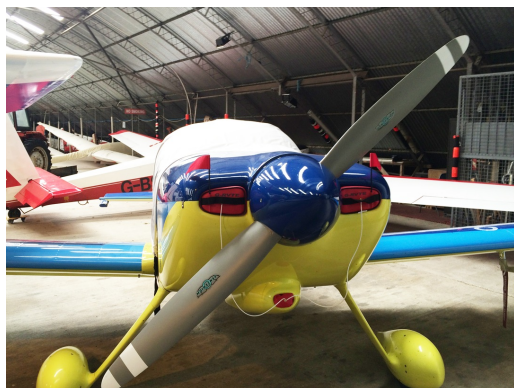
Van's RV-6 Engine Inlet Plugs

Engine Inlet Plugs are custom fit for your Aura Aero Integral R intakes, made with heavy-duty vinyl material, and stuffed with a single block of sculpted urethane foam. Each plug has a zipper that allows the foam to be removed and dried if necessary. Engine plugs have warning flags that are visible from the cockpit or 'remove before flight' streamers sewn onto the face of the plugs. Most plugs are imprinted with the aircraft registration number in black for an extra charge. Storage bag NOT included. Engine plugs may be inserted after flight when the engine is still warm. Engine Inlet Plugs are commonly referred to as Cowl Plugs, Intake Plugs, Cowl Blocks, Engine Blocks, and Engine Bungs.