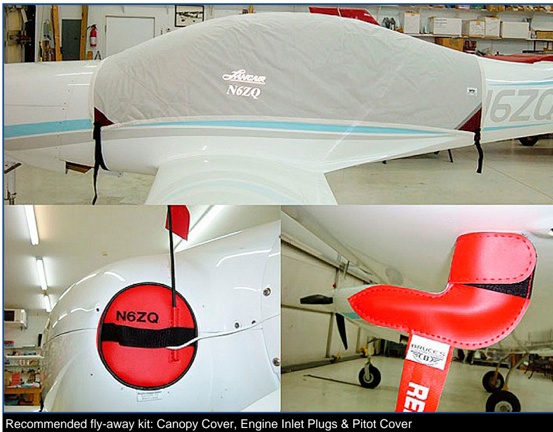
Recommended fly-away kit: Canopy Cover, Engine Inlet Plugs &amp; Pitot Cover