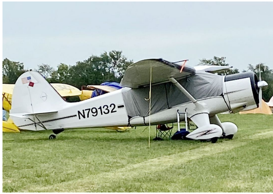
Consolidated Vultee V-77 Travel Cover