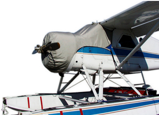
Beaver Windshield/Engine Cover