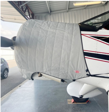
Stinson Reliant V-77, SR, AT-19 Insulated Engine Cover