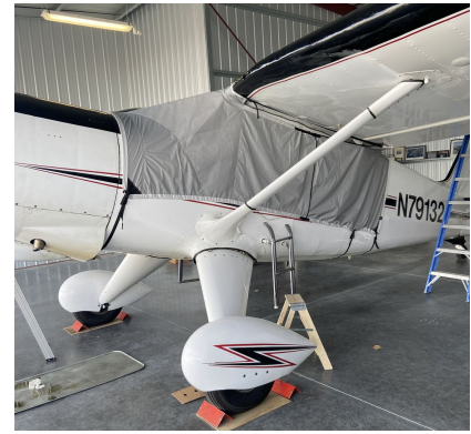
Consolidated Vultee V-77 Travel Cover