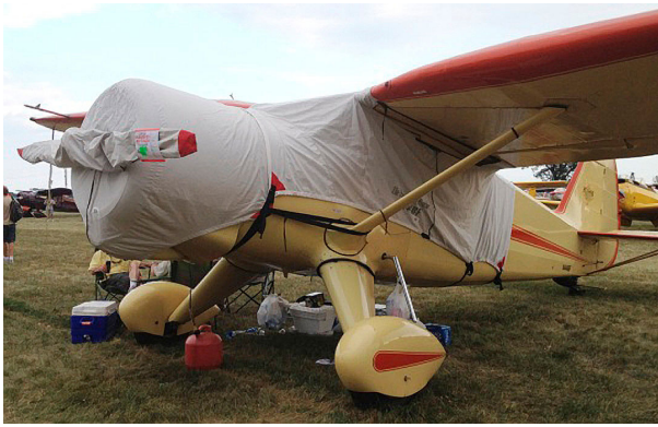
Stinson Reliant Over-the-top Canopy, Engine, and Propeller Cover