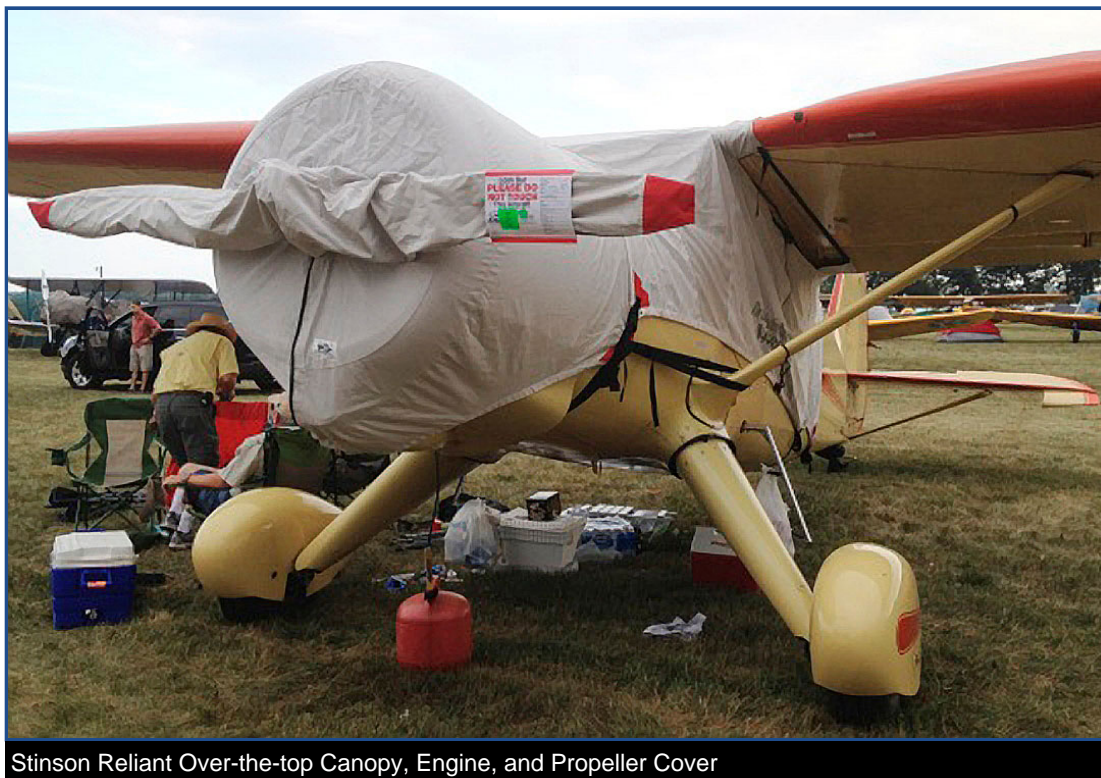
Stinson Reliant Over-the-top Canopy, Engine, and Propeller Cover