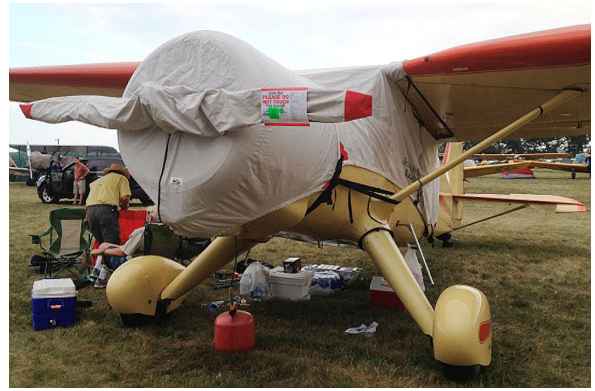
Stinson Reliant Over-the-top Canopy, Engine, and Propeller Cover