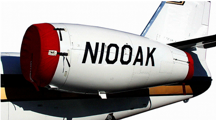
Engine Cover Set for the Astra

The Israel Aircraft Industries Astra (C-38) Bikini Style Engine Covers are a single-piece design using a soft and smooth stretchy fabric. The cover stretches tightly over both the intake and exhaust, installing quickly and easily. These covers are designed to be used as hangar dust covers and have a useful life of approximately one year.