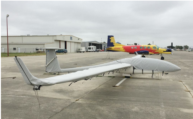
DG-505 Canopy/Nose, Wing, Empennage & Horiz. Stab. Covers DG-505 Canopy/Nose, Wing, Empennage & Horiz. Stab. Covers