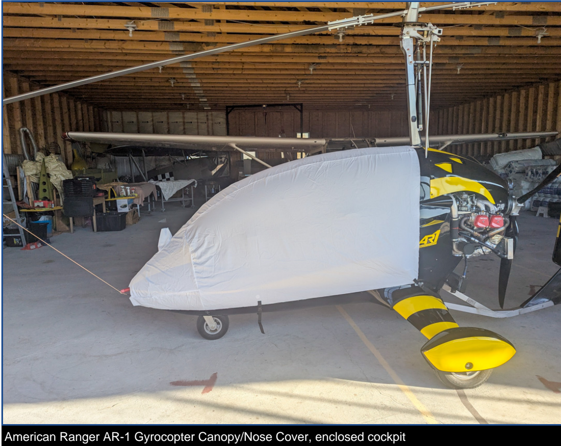
American Ranger AR-1 Gyrocopter Canopy/Nose Cover, enclosed cockpit