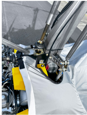
AR1 American Ranger Gyrocopter Travel Cover, Lightweight Canopy/Nose Cover

Travel Covers are made with Silver Solution-Dyed Polyester fabric and fully lined over the entire cover. The material is lightweight and more compact for easy storage in the aircraft. The polyester material is water resistant, but only intended for occasional use outside. We also have an ultra lightweight material available for fitted hangar dust covers. For daily outdoor use, the non-travel Sunbrella Cover is the best choice.