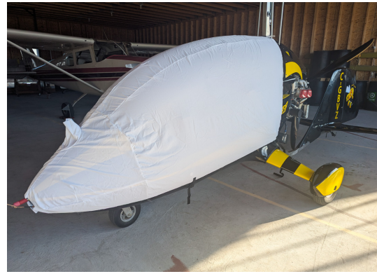
Magni M-16 Tandem Trainer Canopy Cover, 3D model American Ranger AR-1 Gyrocopter Canopy/Nose Cover, enclosed cockpit