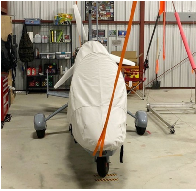
Magni Auto Gyro M16 Cockpit/Nose Cover