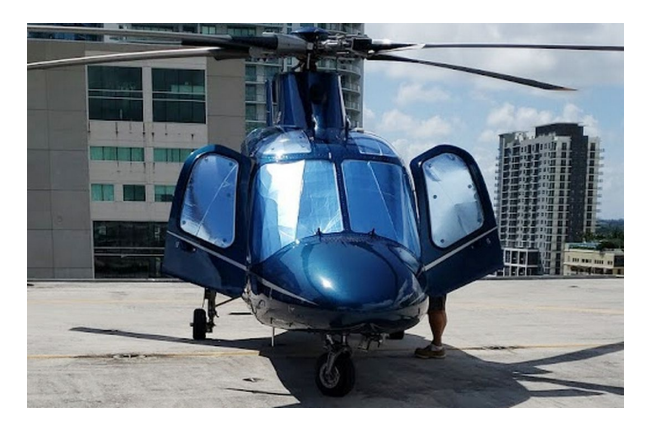
Agusta AW109 Power, A109E Heatshield Set