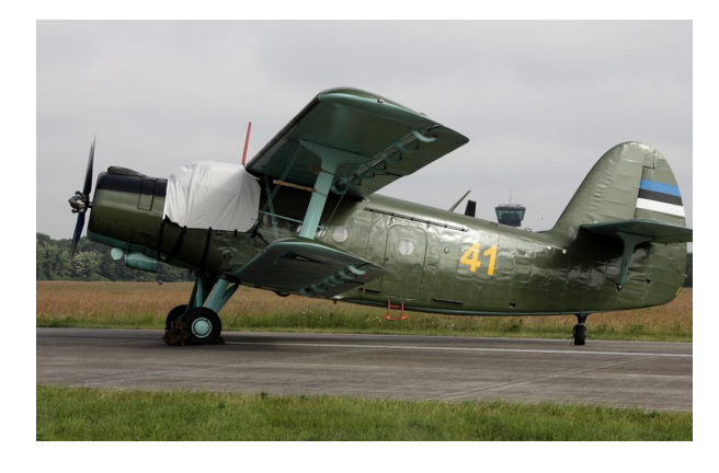
Antonov AN-2 Colt Canopy/Cockpit Cover