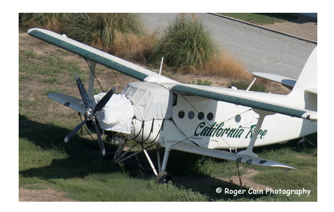
Antonov AN-2 Cockpit and Engine Covers