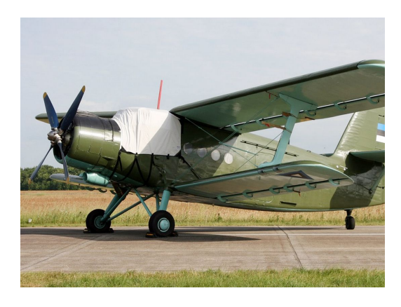
Antonov AN-2 Colt Canopy/Cockpit Cover