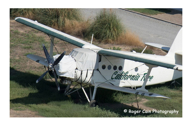
Antonov AN-2 Cockpit and Engine Covers