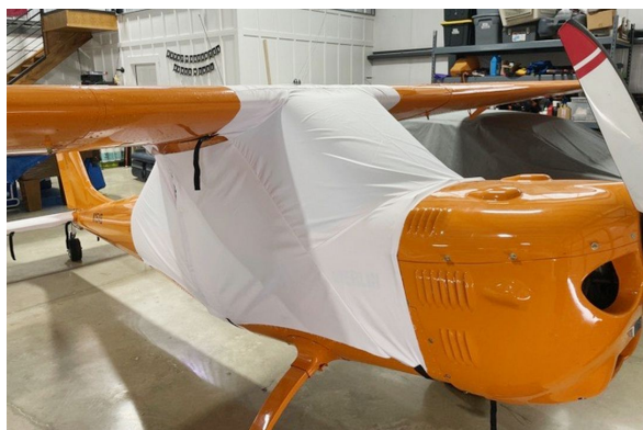
Aeromarine Merlin Over-Top Canopy Cover, test fit cover