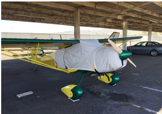
Kitfox Canopy & Engine Covers