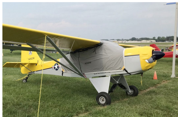
Kitfox Travel Canopy Cover