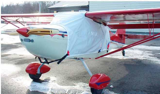
Kitfox IV Over-the-top Canopy Cover

This cover type is made from Silver Acrylic Sunbrella canvas and is 100% lined with a soft and smooth microfiber. Bruce's Custom Covers developed this material combination especially for aircraft protection. The outer material is medium weight and treated for water resistance, UV resistance and anti-static buildup. The inner lining is a very soft and smooth microfiber to prevent scratching. The material is very reflective, and tests show that the cabin interior temperature can be reduced to near-ambient temperature on the hottest of days. It is water, ice and snow repellent, yet breathable to allow moisture to escape from between the cover and the aircraft surface.