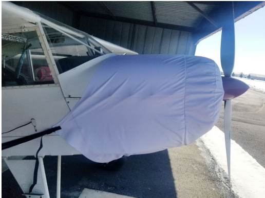
Kitfox Engine Cover, "Radial Cowl" type, test fit