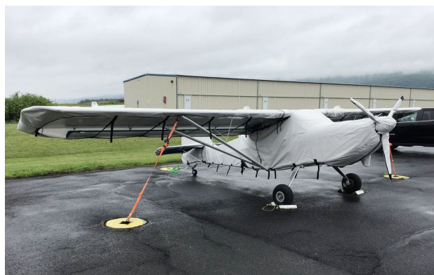
Kitfox 5 Complete Cover Set