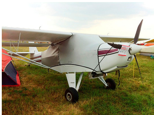
Kitfox Spandex FlyAway Travel Canopy Cover

Travel Covers are made with Silver Solution-Dyed Polyester fabric and only lined over the windshield to save weight. The material is lightweight and more compact for easy stowage in the aircraft. The polyester material is water resistant, but only intended for occasional use outside. We also have an ultra lightweight material available for fitted hangar dust covers. For daily outdoor use, the non-travel Sunbrella Cover is the best choice.