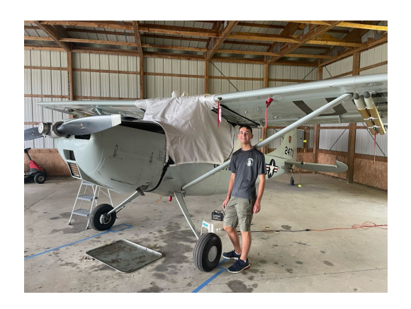
Cessna L-19E Bird Dog Over The Top Style Canopy Cover