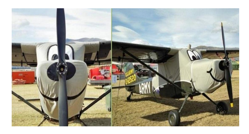
Cessna L-19 Bird Dog Canopy Cover, Engine Cover