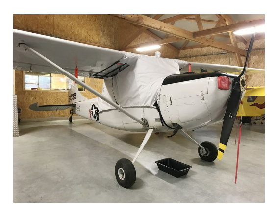
Cessna L-19 Bird Dog Over-Top Canopy Cover