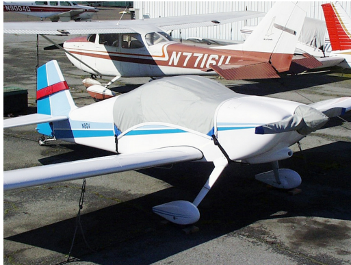
Vans's RV-6 Canopy Cover, Prop Cover