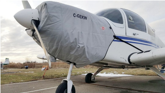
Alarus CH-2000 Insulated Engine Cover

This cover type is made from Silver Acrylic Sunbrella canvas and is 100% lined with a soft and smooth microfiber. Bruce's Custom Covers developed this material combination especially for aircraft protection. The outer material is medium weight and treated for water resistance, UV resistance and anti-static buildup. The inner lining is a very soft and smooth microfiber to prevent scratching. The material is very reflective, and tests show that the cabin interior temperature can be reduced to near-ambient temperature on the hottest of days. It is water, ice and snow repellent, yet breathable to allow moisture to escape from between the cover and the aircraft surface.