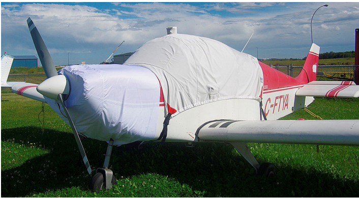
Alarus CH2000 Canopy Cover & Engine Cover (test fit)

This cover type is made from Silver Acrylic Sunbrella canvas and is 100% lined with a soft and smooth microfiber. Bruce's Custom Covers developed this material combination especially for aircraft protection. The outer material is medium weight and treated for water resistance, UV resistance and anti-static buildup. The inner lining is a very soft and smooth microfiber to prevent scratching. The material is very reflective, and tests show that the cabin interior temperature can be reduced to near-ambient temperature on the hottest of days. It is water, ice and snow repellent, yet breathable to allow moisture to escape from between the cover and the aircraft surface.