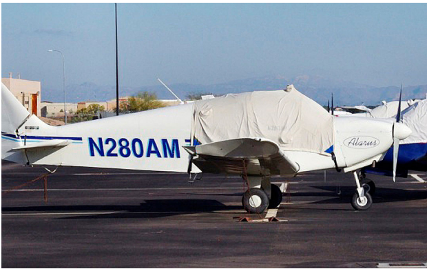
Alarus CH2000 Canopy Cover