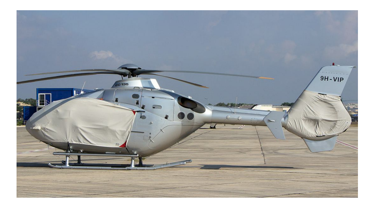
Eurocopter EC-135 Bubble Cover

Eurocopter EC-135 Bubble, Engine, Rotor Hub, Tail Surfaces Covers