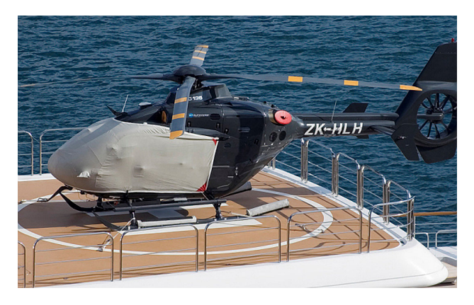
EC-135 Bubble Cover & Exhaust Plugs

This cover type is made from Silver Acrylic Sunbrella canvas and is 100% lined with a soft and smooth microfiber. Bruce's Custom Covers developed this material combination especially for aircraft protection. The outer material is medium weight and treated for water resistance, UV resistance and anti-static buildup. The inner lining is a very soft and smooth microfiber to prevent scratching. The material is very reflective, and tests show that the cabin interior temperature can be reduced to near-ambient temperature on the hottest of days. It is water, ice and snow repellent, yet breathable to allow moisture to escape from between the cover and the aircraft surface.