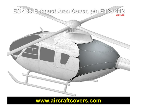
EC135 Exhaust Area Cover, illustration

The Airbus Helicopter EC-135 Intake Cover. Details vary by model, but generally helicopter intake covers are designed to enclose the intake are only. They are smaller than helicopter engine covers, and their attachment details can vary from straps, to snaps, or some combination of the two. Specific information for each model is available on request.