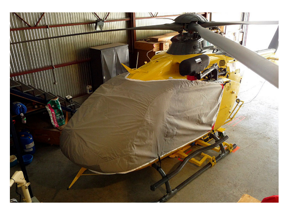
Eurocopter EC-135 Bubble Cover