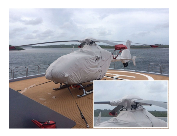
Airbus Helicopter AH135 Main Rotor Hub Cover