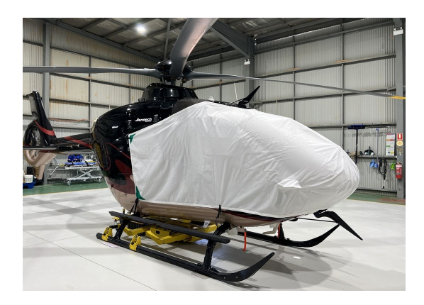
Airbus EC-135 Bubble Cover (with Wire Strike)