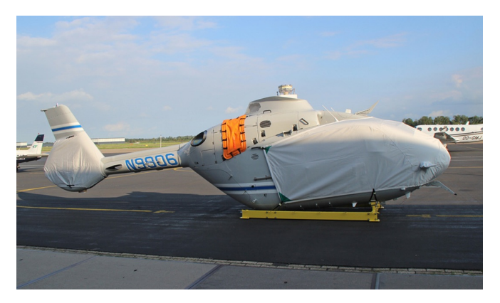
Eurocopter EC-135 Bubble & Tailfan Covers