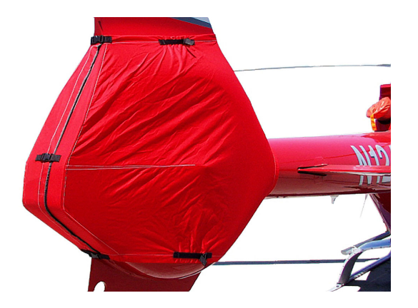
Euirocopter EC-120Tailfan Cover