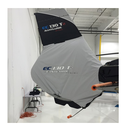
EC-130 Tailfan Cover

The Tailboom Cover details vary by model, but generally the helicopter tail boom cover encloses the tail boom from the "bottleneck" to the aft end. They usually also cover the horizontal stabilizers, and are custom made to allow for antennae, lights, and other protrusions. They attach with straps underneath the tail boom. Covers for the vertical and horizontal stabilizers are also available separately. Specific information for each model is available on request.