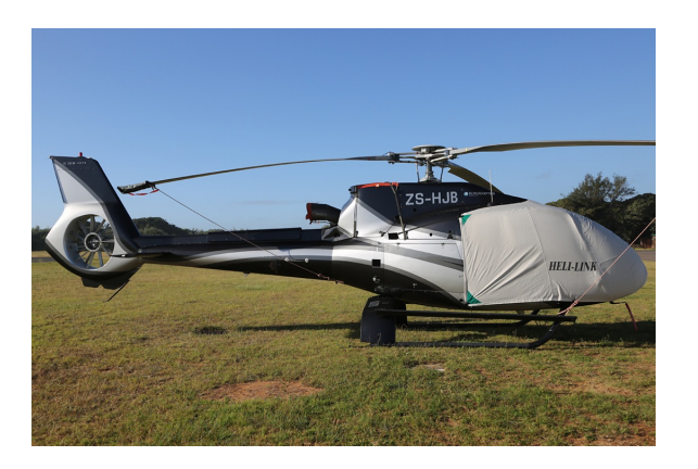
EC-130 Bubble Cover