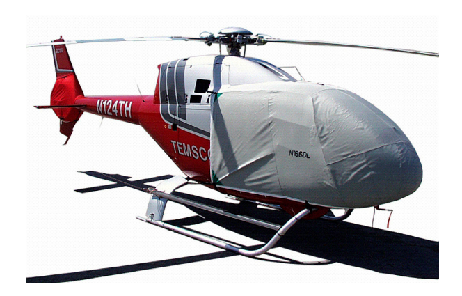
Eurocopter EC-120 Bubble Cover & Tailfan Cover

This cover type is made from Silver Acrylic Sunbrella canvas and is 100% lined with a soft and smooth microfiber. Bruce's Custom Covers developed this material combination especially for aircraft protection. The outer material is medium weight and treated for water resistance, UV resistance and anti-static buildup. The inner lining is a very soft and smooth microfiber to prevent scratching. The material is very reflective, and tests show that the cabin interior temperature can be reduced to near-ambient temperature on the hottest of days. It is water, ice and snow repellent, yet breathable to allow moisture to escape from between the cover and the aircraft surface.