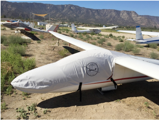
Pilatus B4 Canopy/Nose Cover