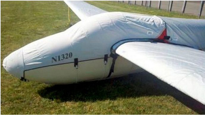
Schweizer SGS 1-26B Canopy/Nose, Wings & Empennage Covers

the hottest of days. It is water, ice and snow repellent, yet breathable to allow moisture to escape from between the cover and the aircraft surface.