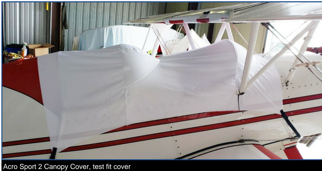
Acro Sport 2 Canopy Cover, test fit cover