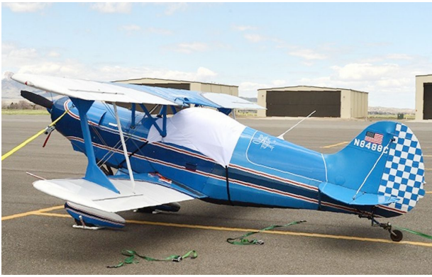
Acro Sport Canopy Cover