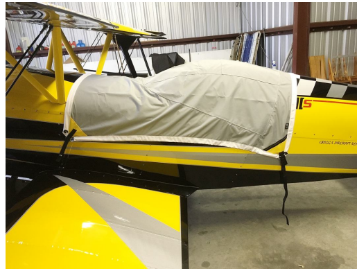
Acro Sport Acro II, Acroduster Travel Cover, Light Weight Travel Canopy Cover