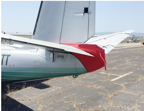
Rockwell Aero Commander Tailcone Cover

WINTER USE MATERIAL - Made with Solution-Dyed Polyester fabric, this option is intended for seasonal use to aid in deicing, rain mitigation, or for occasional travel. The material is lighter and more compact, but more susceptible to UV damage and may have a shorter useful life if used continuously outside than the all-year use material.