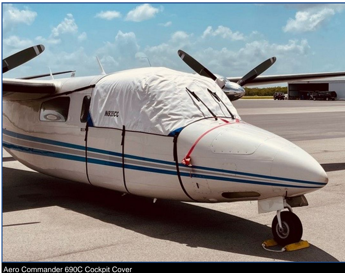
Aero Commander 690C Cockpit Cover