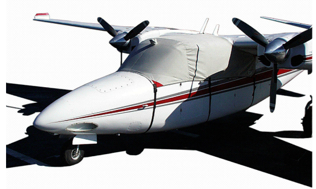
Aero Commander 680 Canopy Cover