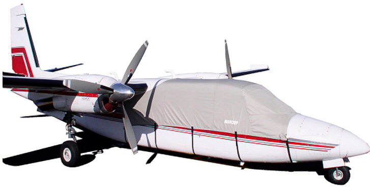
Aero Commander 690b Canopy Cover