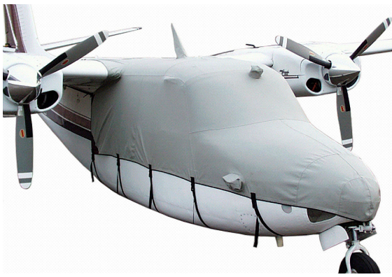
Canopy/Nose Cover (extends over top past leading edge)