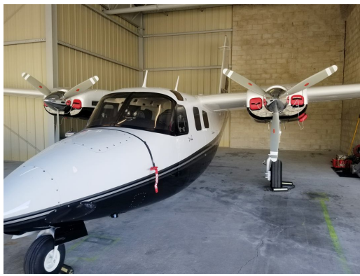
Aero Commander 500-A Pitot Covers