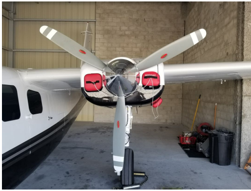
Aero Commander 500-A Engine Plug Set