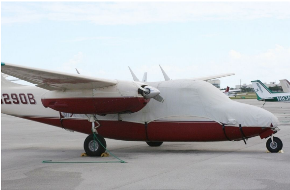
Aero Commander 500 Canopy/Nose Cover Over The Type