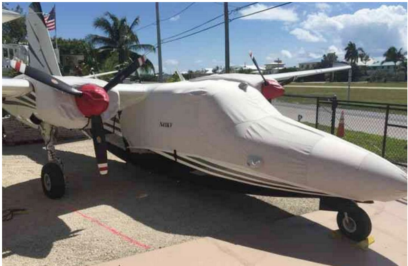
Twin Commander 560F Canopy/Nose & Engine Covers