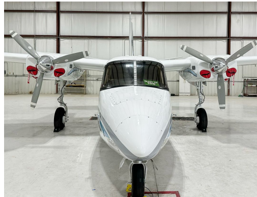
Aero Commander 500B Engine Intake Plugs