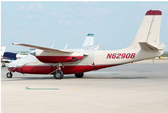
Aero Commander 500 Canopy/Nose Cover, Over-Top Type

This cover type is made from Silver Acrylic Sunbrella canvas and is 100% lined with a soft and smooth microfiber. Bruce's Custom Covers developed this material combination especially for aircraft protection. The outer material is medium weight and treated for water resistance, UV resistance and anti-static buildup. The inner lining is a very soft and smooth microfiber to prevent scratching. The material is very reflective, and tests show that the cabin interior temperature can be reduced to near-ambient temperature on the hottest of days. It is water, ice and snow repellent, yet breathable to allow moisture to escape from between the cover and the aircraft surface.