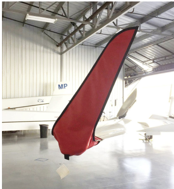
Schleicher ASH Wingtip Pads

Designed to prevent damage to the wingtip in crowded hangars or high traffic areas, these products are made of bright red Naugahyde and thickly padded with a sandwich of closed cell foam. Protects delicate winglets, casters and their housings, and soft finishes.