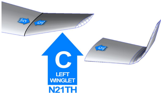
Sailplane Full Cover Set Graphic Indicators (Discus 2B, 3D model)

WINTER USE MATERIAL - Made with Solution-Dyed Polyester fabric, this option is intended for seasonal use to aid in deicing, rain mitigation, or for occasional travel. The material is lighter and more compact, but more susceptible to UV damage and may have a shorter useful life if used continuously outside than the all-year use material.