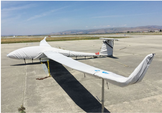
Schempp-Hirth Discus 2B Full Cover Set