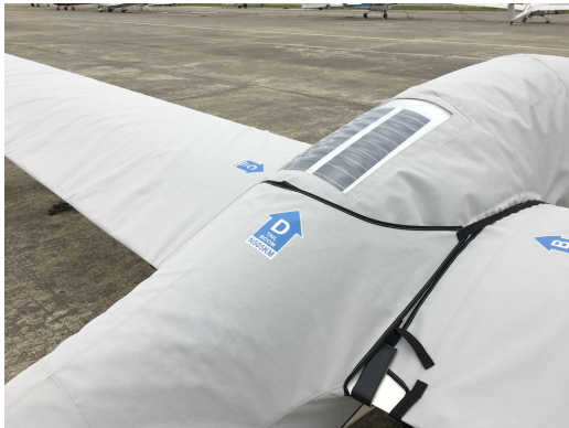
DG-505 Full Cover Set