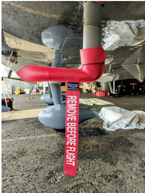
Van's RV-14 Pitot Cover

and dried if necessary. Engine plugs have warning flags that are visible from the cockpit or 'remove before flight' streamers sewn onto the face of the plugs. Most plugs are imprinted with the aircraft registration number in black for an extra charge. Storage bag NOT included. Engine plugs may be inserted after flight when the engine is still warm. Engine Inlet Plugs are commonly referred to as Cowl Plugs, Intake Plugs, Cowl Blocks, Engine Blocks, and Engine Bungs.