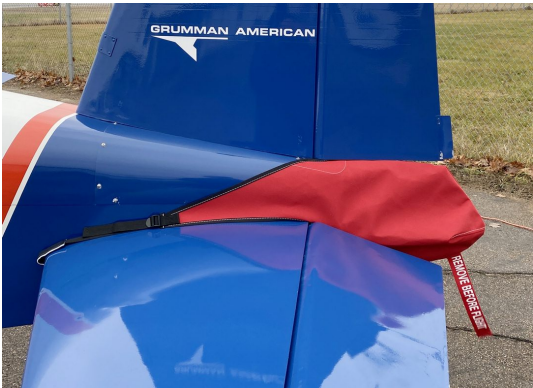
Grumman AA-1 Tailcone Cover

WINTER USE MATERIAL - Made with Solution-Dyed Polyester fabric, this option is intended for seasonal use to aid in deicing, rain mitigation, or for occasional travel. The material is lighter and more compact, but more susceptible to UV damage and may have a shorter useful life if used continuously outside than the all-year use material.