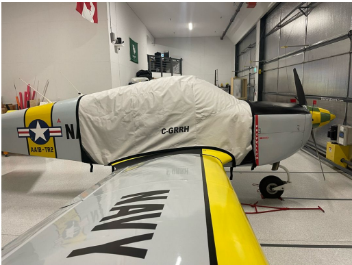
Grumman AA-1B Extended Canopy Cover

This cover type is made from Silver Acrylic Sunbrella canvas and is 100% lined with a soft and smooth microfiber. Bruce's Custom Covers developed this material combination especially for aircraft protection. The outer material is medium weight and treated for water resistance, UV resistance and anti-static buildup. The inner lining is a very soft and smooth microfiber to prevent scratching. The material is very reflective, and tests show that the cabin interior temperature can be reduced to near-ambient temperature on the hottest of days. It is water, ice and snow repellent, yet breathable to allow moisture to escape from between the cover and the aircraft surface.