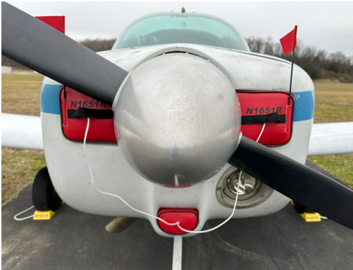
Grumman AA1 Engine Inlet Plugs