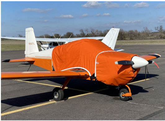
AA-1 Extended Canopy & Fully Enclosed Engine Cover

This cover type is made from Silver Acrylic Sunbrella canvas and is 100% lined with a soft and smooth microfiber. Bruce's Custom Covers developed this material combination especially for aircraft protection. The outer material is medium weight and treated for water resistance, UV resistance and anti-static buildup. The inner lining is a very soft and smooth microfiber to prevent scratching. The material is very reflective, and tests show that the cabin interior temperature can be reduced to near-ambient temperature on the hottest of days. It is water, ice and snow repellent, yet breathable to allow moisture to escape from between the cover and the aircraft surface.