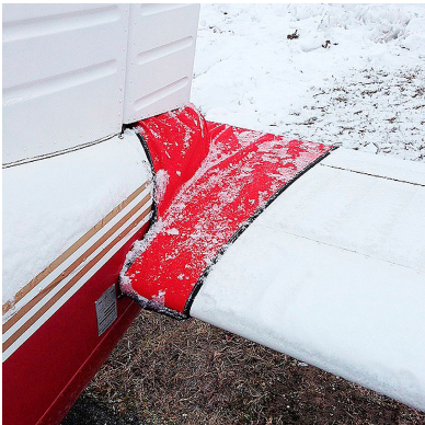
Piper PA-28 Tailcone Cover