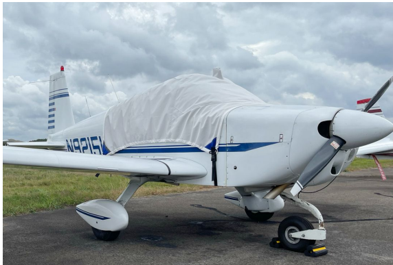
Grumman AA-1 Canopy Cover