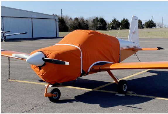
AA-1 Extended Canopy & Fully Enclosed Engine Cover