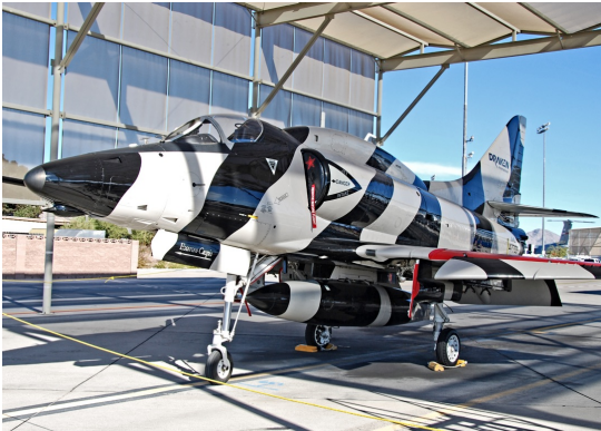
A4 Skyhawk Engine Inlet Plugs

The Engine Inlet Plugs are custom fit for your McDonnell Douglas A-4 Skyhawk, single & tandem intakes, made with heavy-duty vinyl material, and stuffed with a single block of sculpted urethane foam. Each plug has a zipper that allows the foam to be removed and dried if necessary. Engine plugs have 'remove before flight' streamers sewn onto the face of the plugs. Most plugs are imprinted with the aircraft registration number in black for an extra charge. Storage bag NOT included. Engine plugs may be inserted after flight when the engine is still warm. Engine Inlet Plugs are commonly referred to as Cowl Plugs, Intake Plugs, Cowl Blocks, Engine Blocks, and Engine Bung.