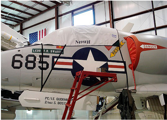
A-4 Skyhawk Canopy Cover