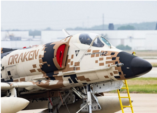
McDonnell Douglas A4 Skyhawk Engine Intake Plugs