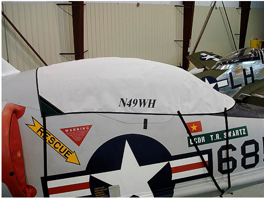
A-4 Skyhawk Canopy Cover

This cover type is made from Silver Acrylic Sunbrella canvas and is 100% lined with a soft and smooth microfiber. Bruce's Custom Covers developed this material combination especially for aircraft protection. The outer material is medium weight and treated for water resistance, UV resistance and anti-static buildup. The inner lining is a very soft and smooth microfiber to prevent scratching. The material is very reflective, and tests show that the cabin interior temperature can be reduced to near-ambient temperature on the hottest of days. It is water, ice and snow repellent, yet breathable to allow moisture to escape from between the cover and the aircraft surface.