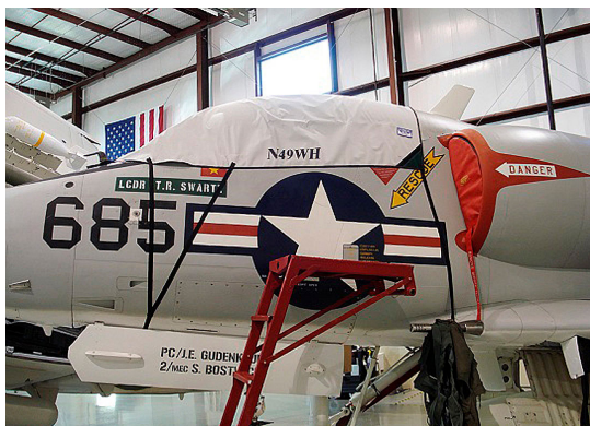
A-4 Skyhawk Canopy Cover

Travel Covers are made with Silver Solution-Dyed Polyester fabric and only lined over the windshield to save weight. The material is lightweight and more compact for easy stowage in the aircraft. The polyester material is water resistant, but only intended for occasional use outside. We also have an ultra lightweight material available for fitted hangar dust covers. For daily outdoor use, the non-travel Sunbrella Cover is the best choice.