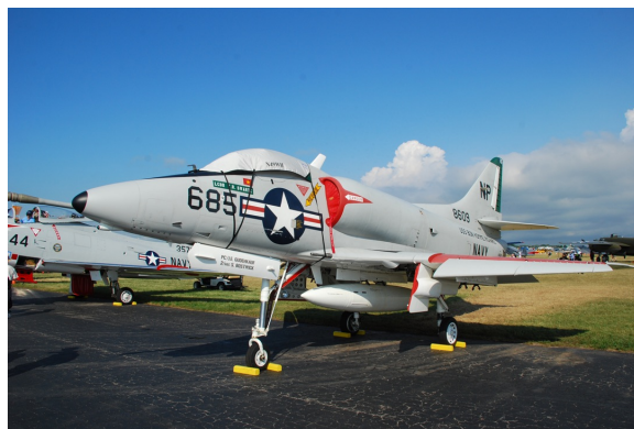
A-4 Skyhawk Canopy Cover