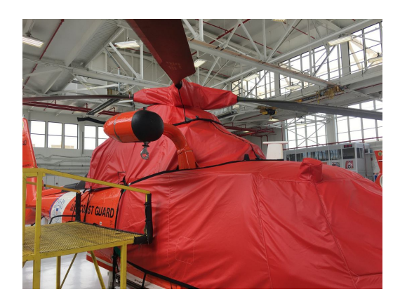
MH-65C Bubble Cover, extended Nose/Radome Model, padded over U.S. Coast Guard HH-65 Dolphin Bubble, Engine & Rotor windows, P/N: A365-210 Mast Covers