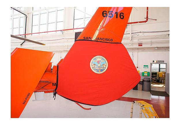
MH-365C Dauphin Tail Fan Fenestron Cover

The Tailboom Cover details vary by model, but generally the helicopter tail boom cover encloses the tail boom from the "bottleneck" to the aft end. They usually also cover the horizontal stabilizers, and are custom made to allow for antennae, lights, and other protrusions. They attach with straps underneath the tail boom. Covers for the vertical and horizontal stabilizers are also available separately. Specific information for each model is available on request.