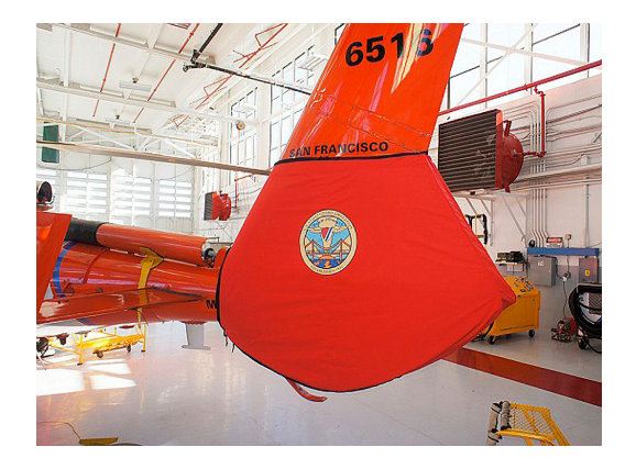
MH-365C Dauphin Tail Fan Fenestron Cover