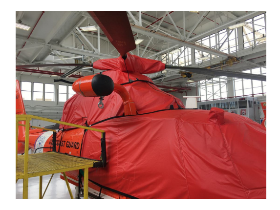
U.S. Coast Guard HH-65 Dolphin Bubble, Engine & Rotor Mast Covers U.S. Coast Guard HH-65 Dolphin Bubble, Engine & Rotor Mast Covers