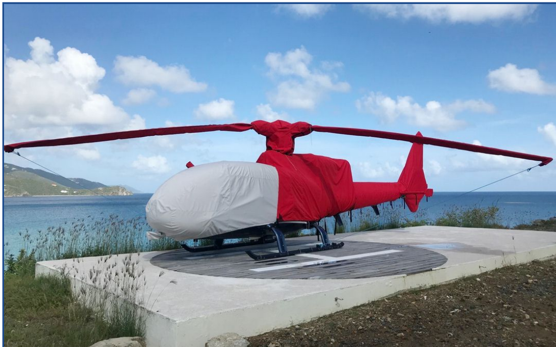
Aerospatiale AS341/342 Gazelle Full Cover Set