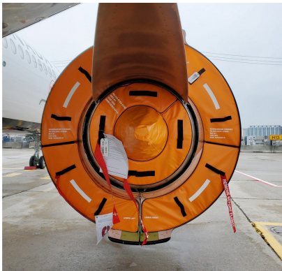
Airbus A320 Exhaust & Bypass Vent Plugs