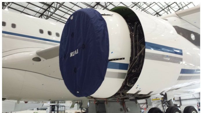
Airbus 340 Intake Covers