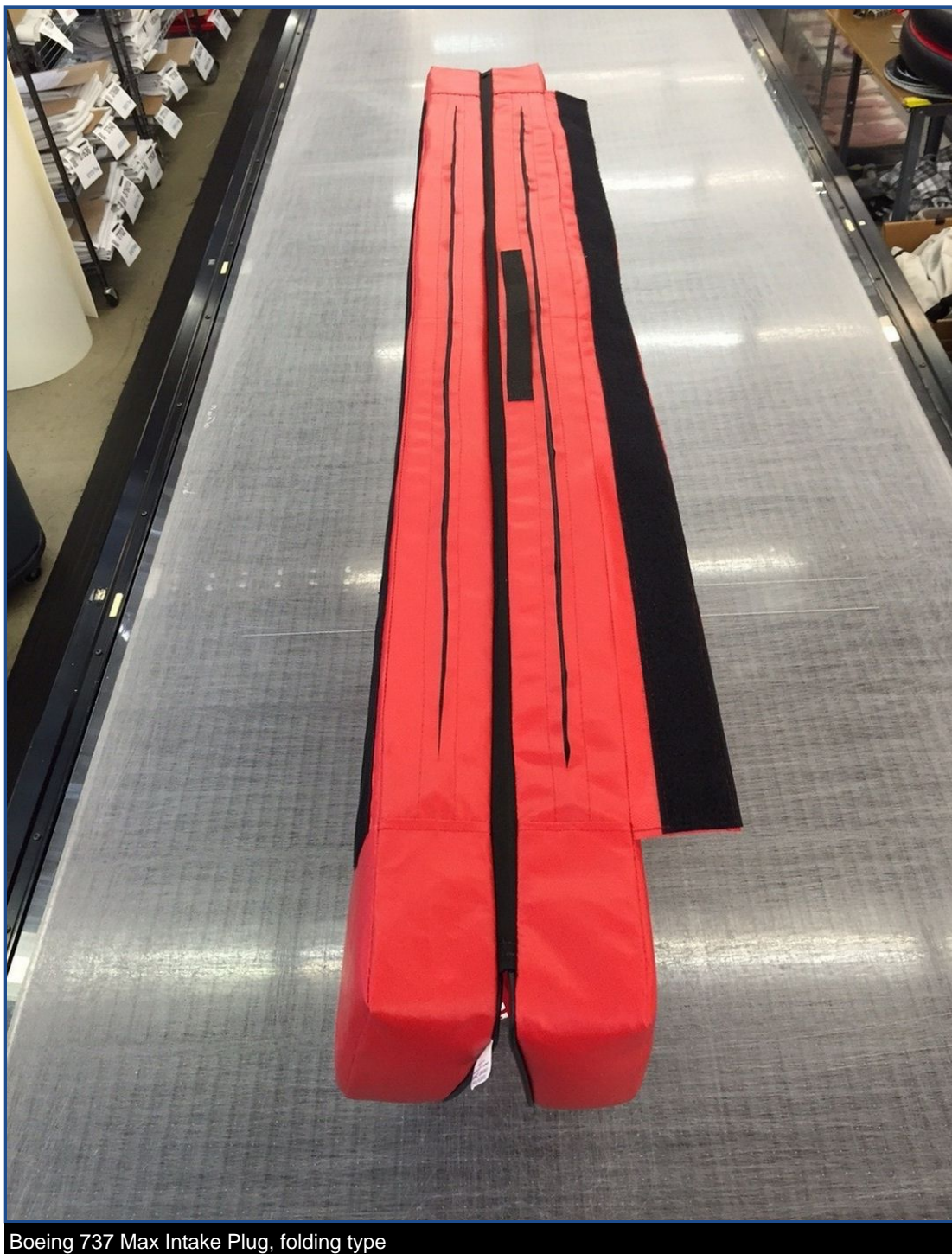
Boeing 737 Max Intake Plug, folding type